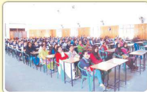
Gyalshing Girls Sr. Sec. School, West Sikkim