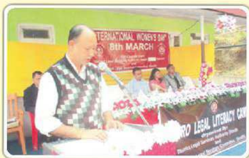
Mamring, South Sikkim