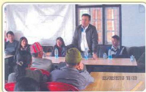
Borong, South Sikkim