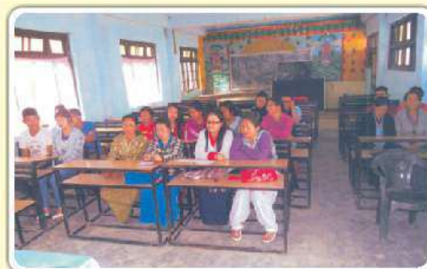
Hee-Gyathang, North Sikkim