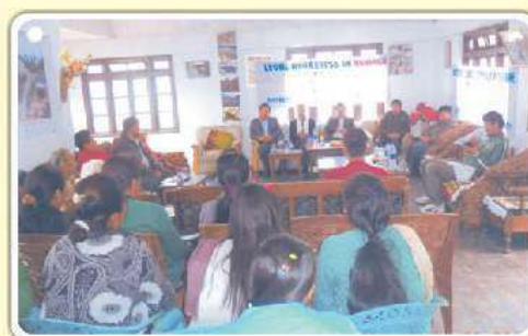
Rel, Naga, North Sikkim