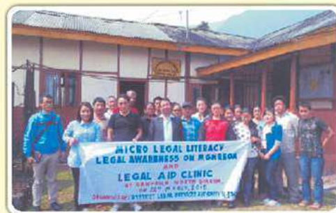
Namprick, North Sikkim