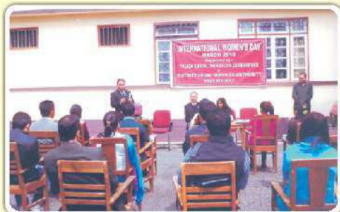
Civil Court premises, Gyalshing, West Sikkim