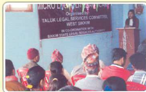
Arigaon, West Sikkim