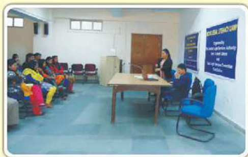
ICFAI College, Sichey, East Sikkim