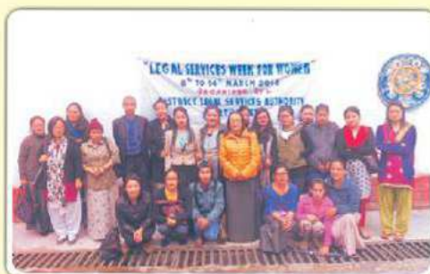
ADR Centre, Mangan, North Sikkim