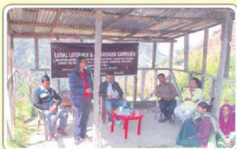
Phantam, South Sikkim