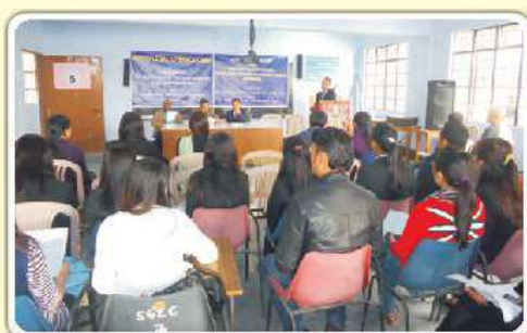
Sikkim Govt. Law College, Burtuk, East Sikkim