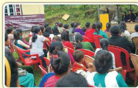
Meong and Magyong, West Sikkim