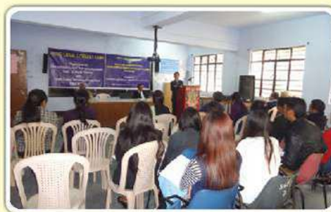
Sikkim Govt. Law College, Burtuk, East Sikkim