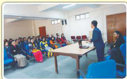
ICFAI College, Sichey, East Sikkim