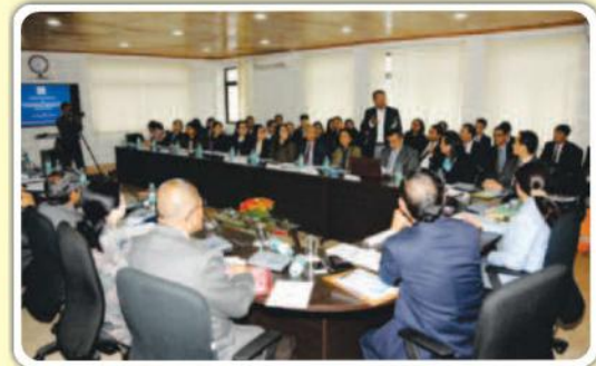
Sensitization programme in progress