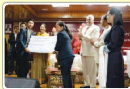
Prize distribution to the winners of the Academic Quiz Contest