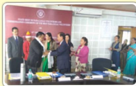
Glimpses of the programme