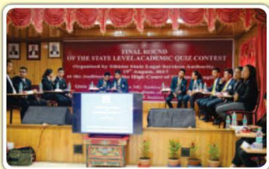
The final round of the Academic Quiz Contest