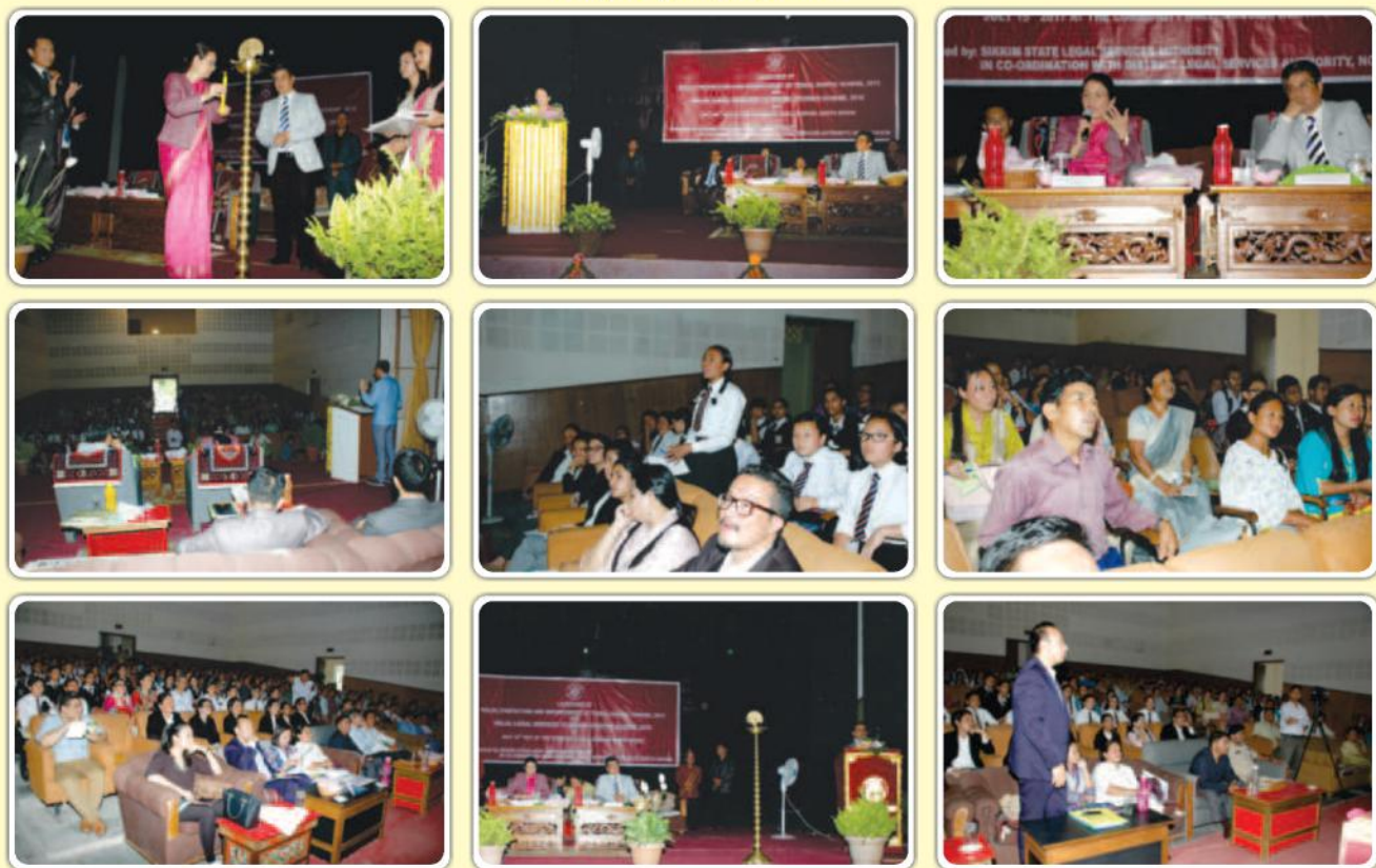
Glimpses of the programme

Apart from the two Schemes launched, the Resource Persons deliberated on Sikkim Anti-Drugs Act, 2006 and Welfare Schemes of the Central/State Government for Senior Citizens, Women and Children.