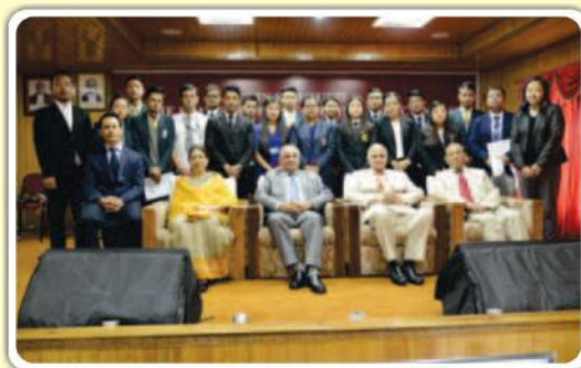
Hon'ble dignitaries with the participants