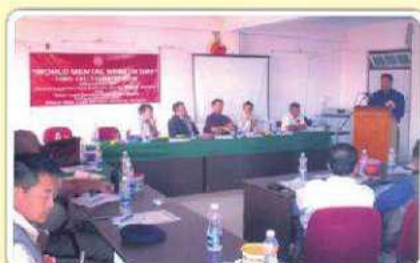
District Hospital, Namchi, South Sikkim