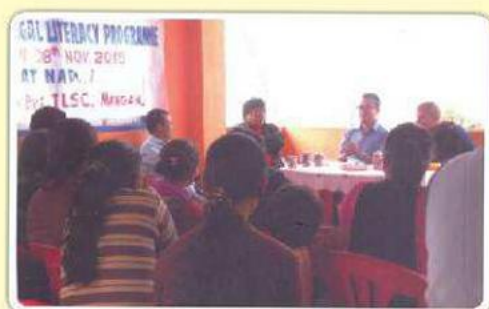
Naday, North Sikkim