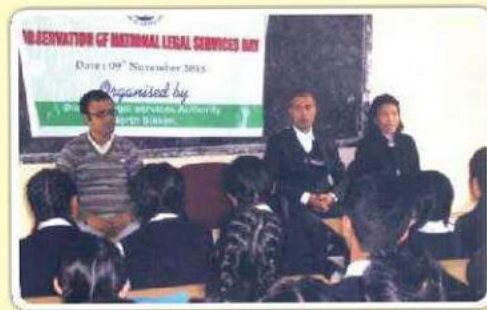
Manul Sec. School, North Sikkim