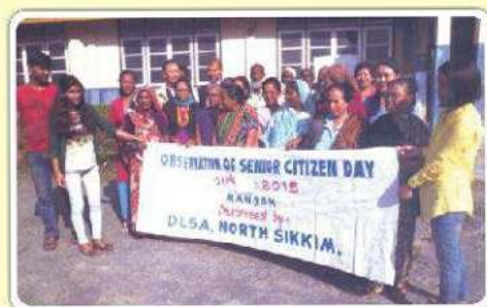
BAC, Mangan, North Sikkim