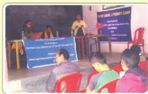
V.L.C.&S. Centre, Lingtam-Rongli, East Sikkim