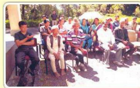
Civil Court Premises, Gyalshing, West Sikkim