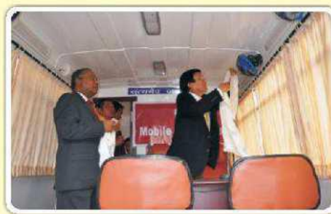
Mobile Lok Adalat in progress