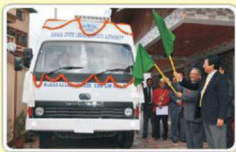
Flagged off of the Multi-Utility Vehicle