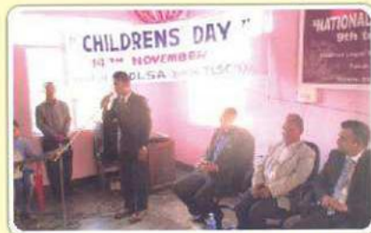
Turuk Destitute Home, South Sikkim