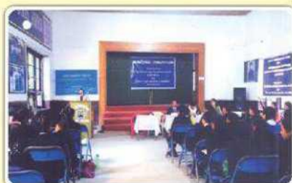
Paljor Namgyal Girls Sr. Sec. School, Gangtok, East Sikkim