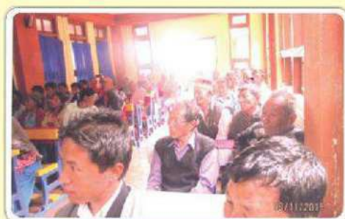
Yangang, South Sikkim