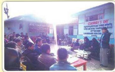
Upper Sapung, West Sikkim