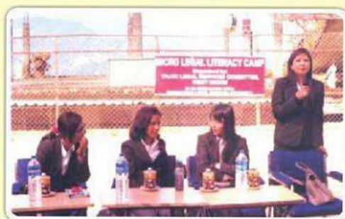
Kaluk Sr. Sec. School, West Sikkim