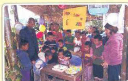
Tarcon Lee Shelter Home, North Sikkim