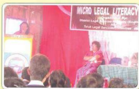
Bikmat, South Sikkim