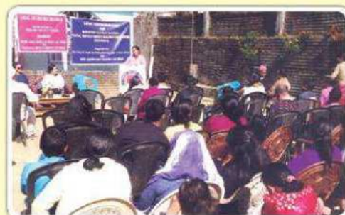
Middle Khesey, Samdong, East Sikkim