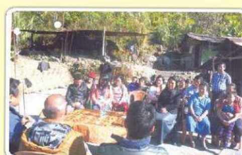
Bey, Dzongu, North Sikkim