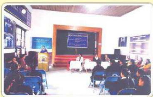
Paljor Namgyal Girls Sr. Sec. School, Gangtok, East Sikkim