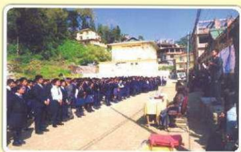
West Point Sr. Sec. School, Gangtok, East Sikkim