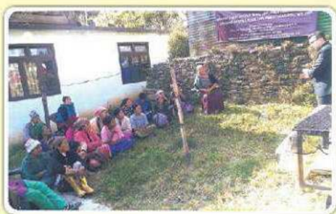
Yangtey, Gyalshing, West Sikkim