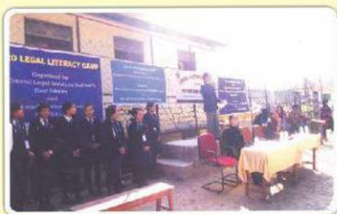
West Point Sr. Sec. School, Gangtok, East Sikkim