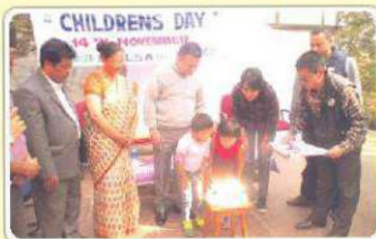
J.N.M.I. Namchi, South Sikkim