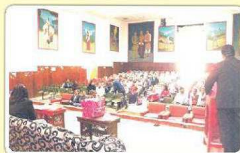
Community Hall, Gyalshing, West Sikkim