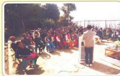
Middle Khesey, Samdong, East Sikkim