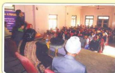
VLC&SC, Lingtam-Rongli, East Sikkim