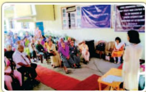
Ishwarrambha Samiti Sangh (Old Age Home) Jalipool, East Sikkim