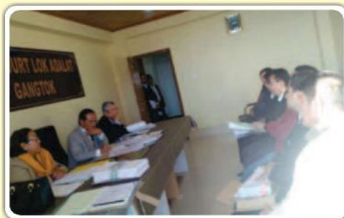
High Court Lok Adalat in progress