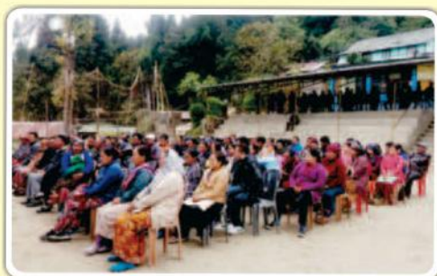
4 th Mile, JN Road, East Sikkim