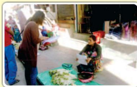
Gyalshing, West Sikkim