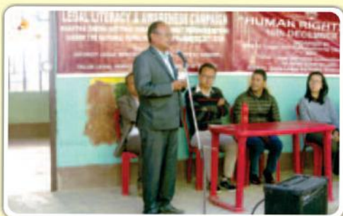
Pamphok, South Sikkim