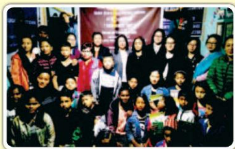
Subh Laxmi Social Organization, Chandmari, East Sikkim