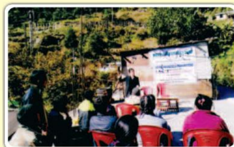
Deythang, North Sikkim