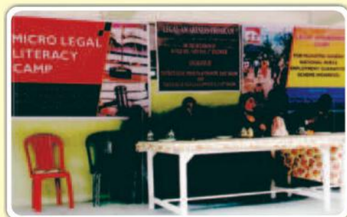
Govt. Jr. High School, 4 th Mile, J.N. Road