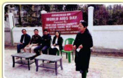
Construction Site of the Court of CJ-JM, Soreng, West Sikkim