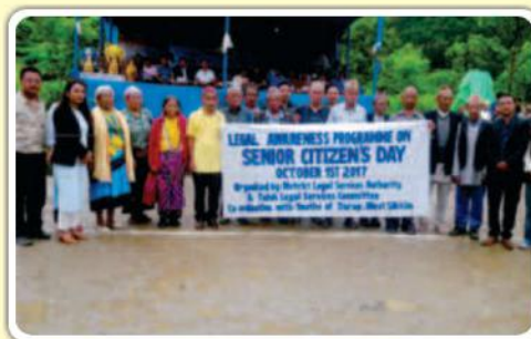
Darap, West Sikkim