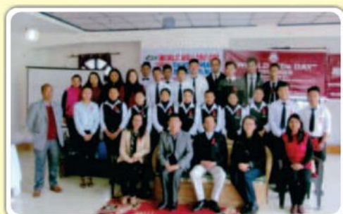
Don Bosco Technical Institute, 12 th Mile, South Sikkim