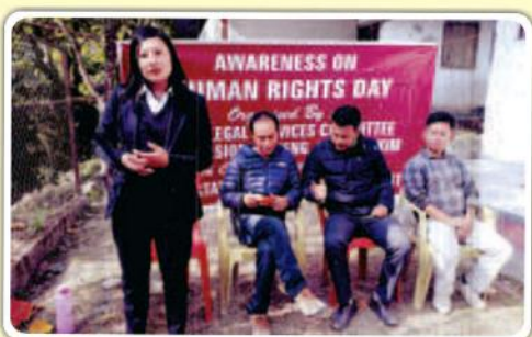
Upper Pakki Gaon, Soreng Sub-Division, West Sikkim