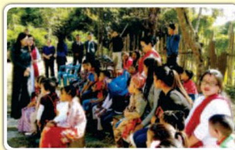
Saraswati Vidhyalaya, West Sikkim