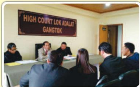
High Court Lok Adalat in progress