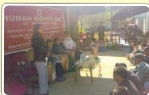
District Prison, Boomtar, South Sikkim