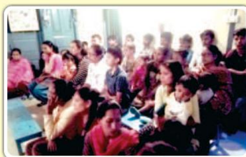
Sishu Bhawan (Missionary of Charity), Sichey, East Sikkim