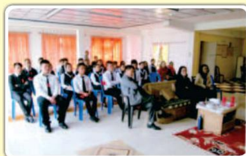
12 th Mile, Jorethang Road, South Sikkim