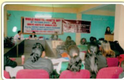
District Hospital, Namchi, South Sikkim