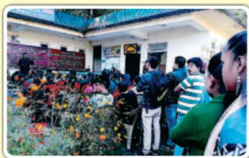
Chumbong, West Sikkim