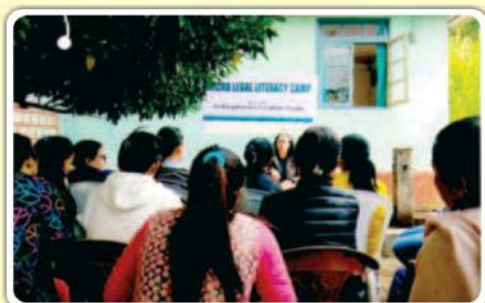
Namok, North Sikkim