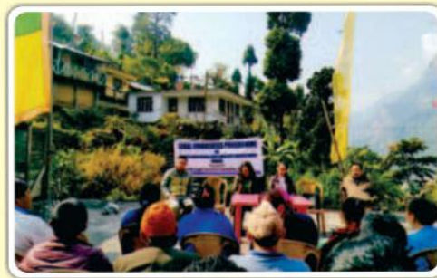
Toong, North Sikkim