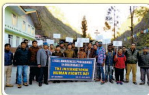
Chungthang, North Sikkim