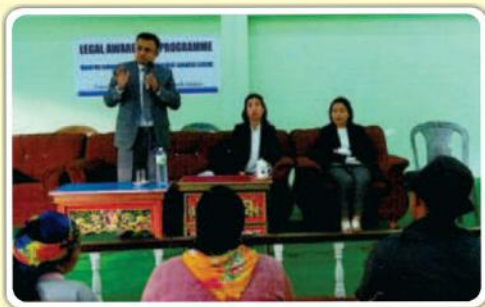
Lingchom, North Sikkim