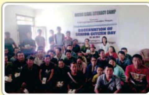
Phensang, North Sikkim