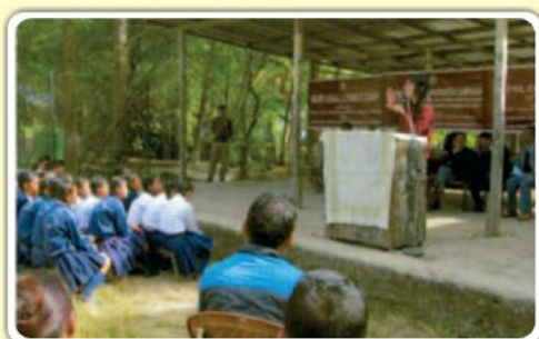
Kateng, South Sikkim