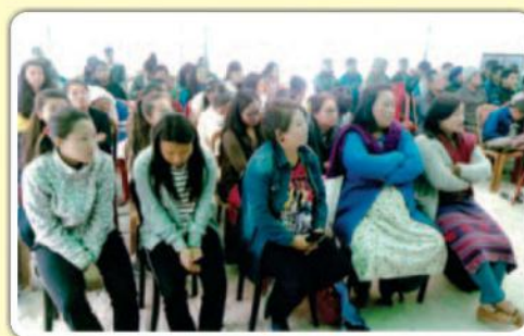
Darap, West Sikkim