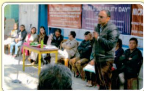
Mangley, South Sikkim