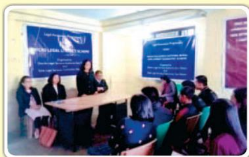
Juvenile Justice Board, Gangtok