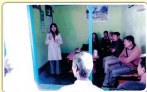
Phuncheybong, West Sikkim