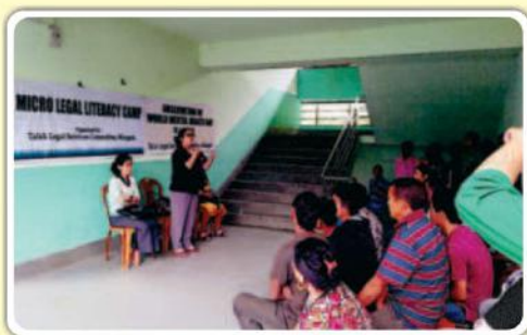
Power Colony, Mangan, North Sikkim