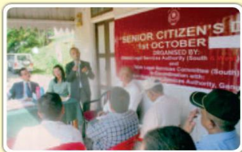
Soldier Board Office, Namchi, South Sikkim