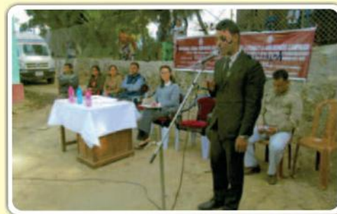
Kateng, South Sikkim