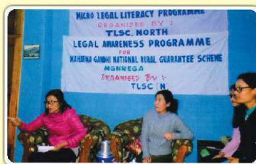
Upper Zimchung, North Sikkim