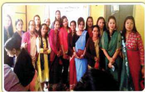
Panchayat Hall, Rhenock, East District