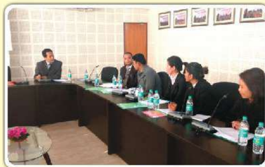
Meeting in progress