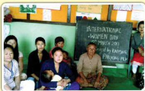
Kaiyong, Pakyong, East District

International Women's Day organized by various Para-Legal Volunteers and Legal Literacy Club, PNG School, Gangtok