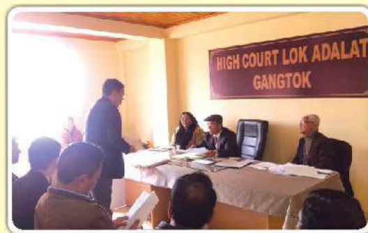
High Court Lok Adalat in progress