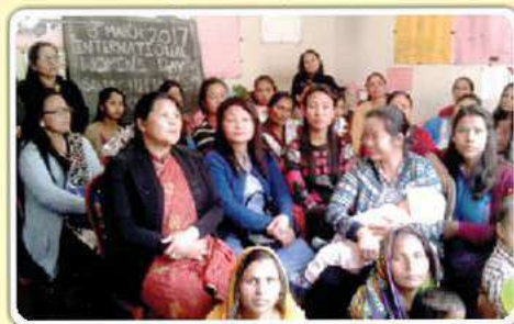
Pakyong ICDS Centre, East District