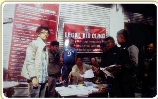
Singtam, East District