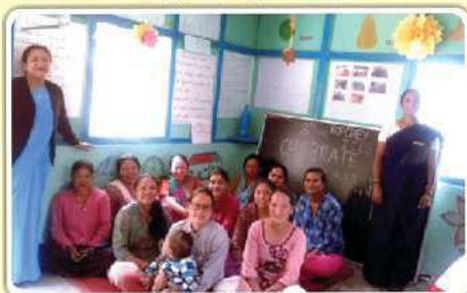
Rhenock ICDS Centre, East District