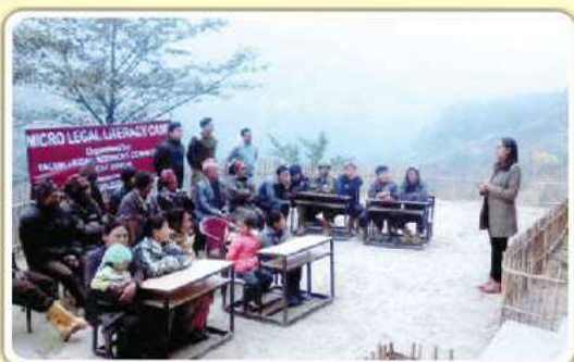
Jhakri Dunga, West Sikkim