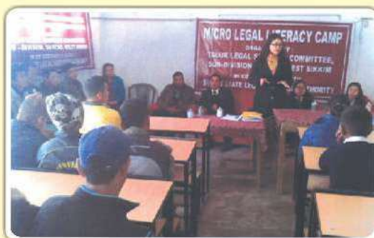
Ribdi Govt. Sr. Sec. School, Soreng Sub-Division, West Sikkim