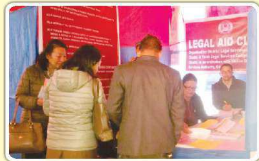
Jorethang, South District