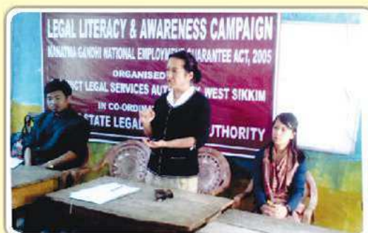
Chingthang, West Sikkim