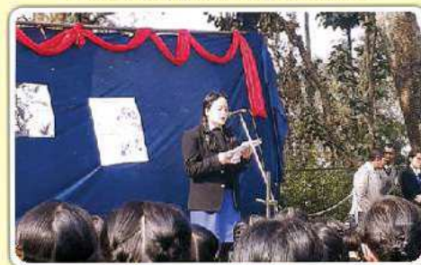
PNG School, Gangtok, East District