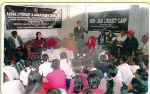
Kamerey Jr. High School, South Sikkim