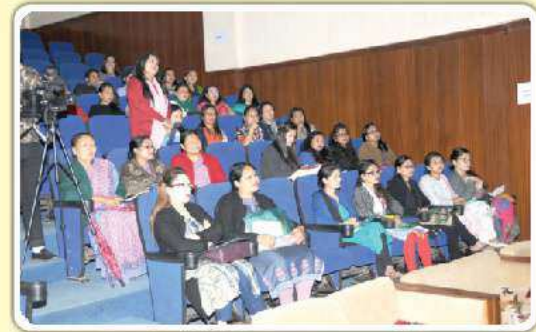
Interaction with members of Internal Complaints Committee at Mini Hall, Manan Kendra, Gangtok