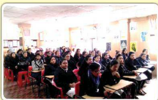
Directorate of Handicraft & Handloom Deptt., Gangtok, East Sikkim