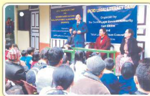
Merung, East Sikkim