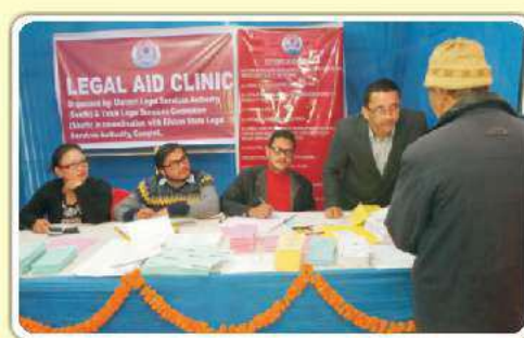
Jorethang, South Sikkim