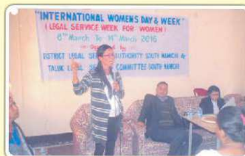
Tinik Chisopani, South Sikkim