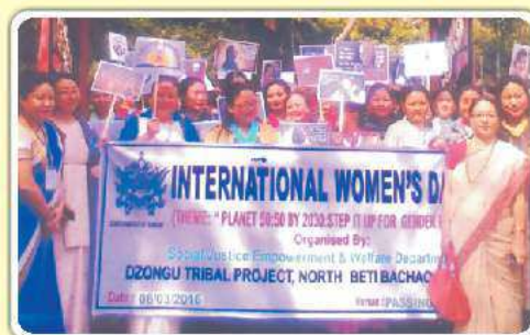
Dzongu Passingdang BAC, North Sikkim