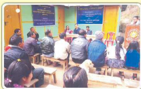
Central Point School, Pendam, East Sikkim