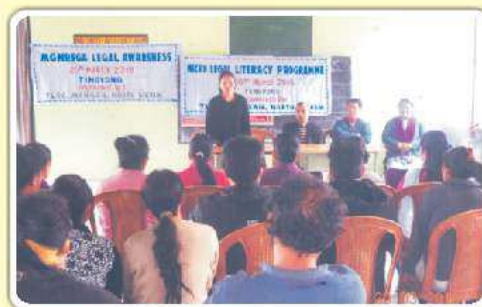
Tingvong, North Sikkim