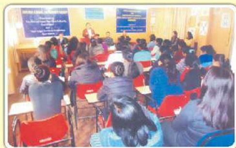
Directorate of H & H, Zero Point, Gangtok, East Sikkim