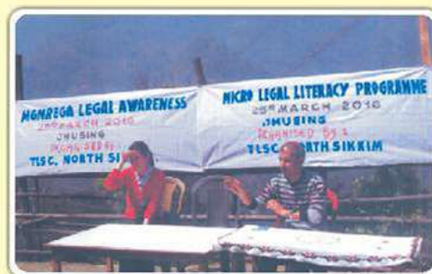
Jhusing, North Sikkim