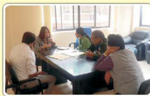
Mediation in progress at Mediation Centre, East at Gangtok