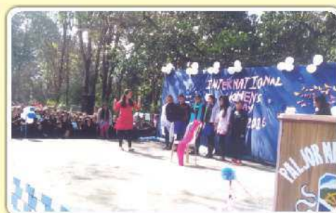
Paljor Namgyal Girls School, Gangtok, East Sikkim