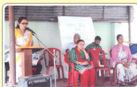
Chewribotey School, Central Pendam, East Sikkim