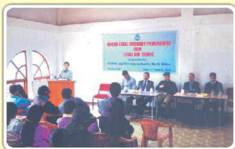
Kabi, North Sikkim