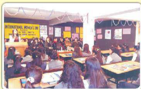
Govt. College, Gyalshing, West Sikkim