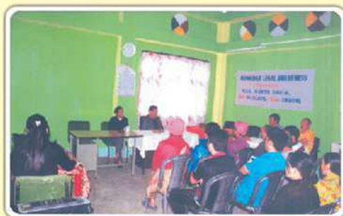
Lingdong, North Sikkim