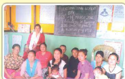
Kaiyong ICDS Centre, East Sikkim