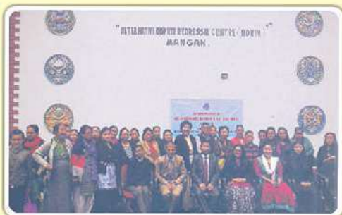
ADR Centre (North), Mangan, North Sikkim