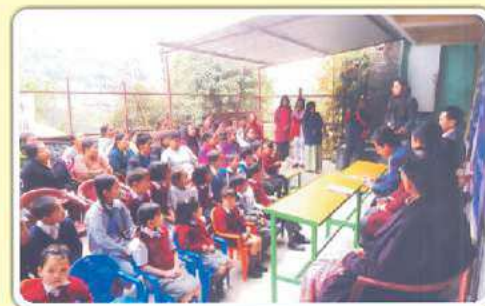
Canaan Academy, Merung, East Sikkim