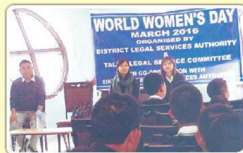
Uttarey, West Sikkim