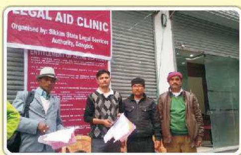
Singtam, East Sikkim

For the East District, the legal aid stall was manned by the staff of Sikkim SLSA at Singtam East Sikkim.