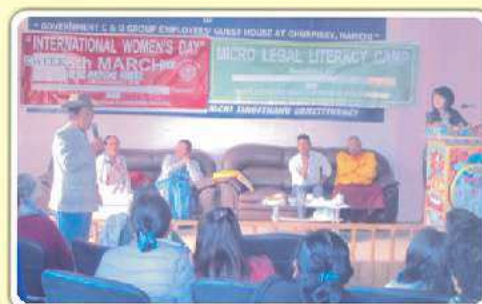
Ghurpisey, Namchi, South Sikkim