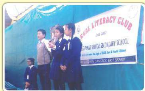
West Point. Sr. Sec. School, Gangtok, East Sikkim