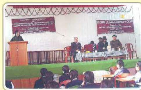
Govt. Sr. Sec. School, Dentam, West Sikkim