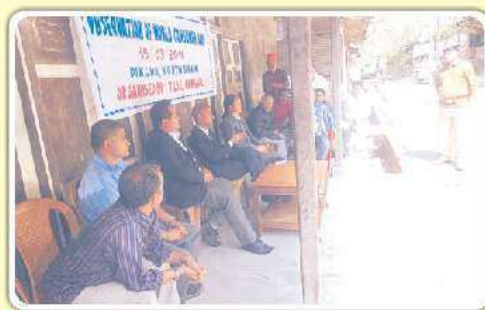
Dikchu, North Sikkim