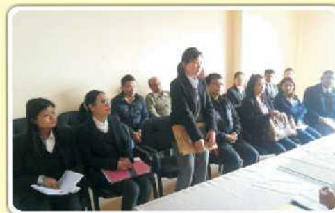
High Court Lok Adalat in progress