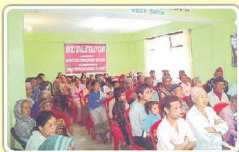
Lungchok, West Sikkim