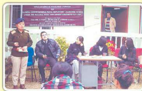
Langang GPU, West Sikkim