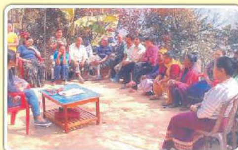
Khorlong, South Sikkim