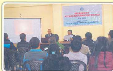
D.C. Office, Mangan, North Sikkim