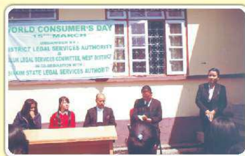
Civil Court premises, Gyalshing, West Sikkim