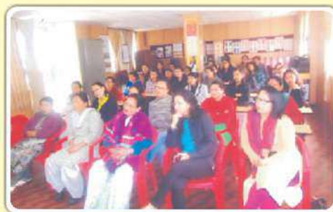
Directorate of H & H, Zero Point, Gangtok, East Sikkim