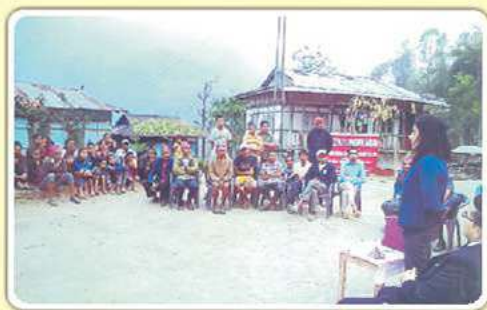
Lungyang, West Sikkim