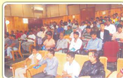
Singtam Bazaar, East Sikkim