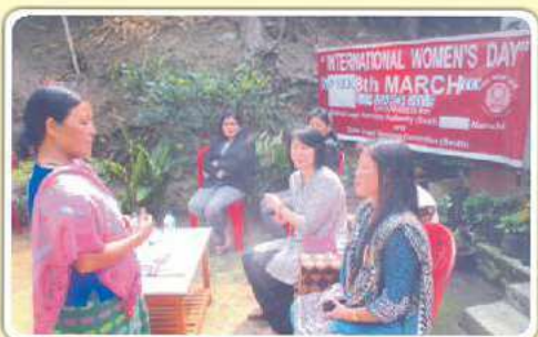
Upper Kamrang, South Sikkim