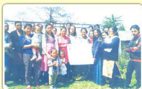
Pangthang Lingdok, East Sikkim