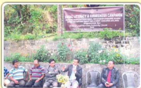
Sammatar, South Sikkim