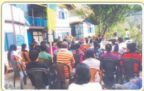
Thasa, Lingdong, East Sikkim