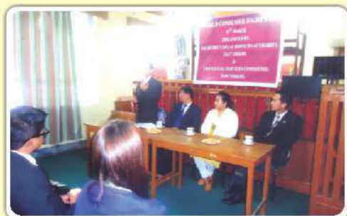
District Courts Complex, Sichey, East Sikkim