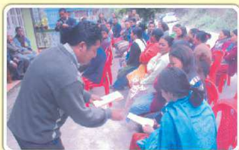
Lower Boomtar, Namchi, South Sikkim