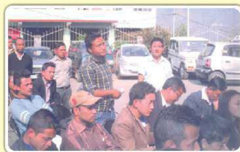
District Courts premises, Namchi, South Sikkim