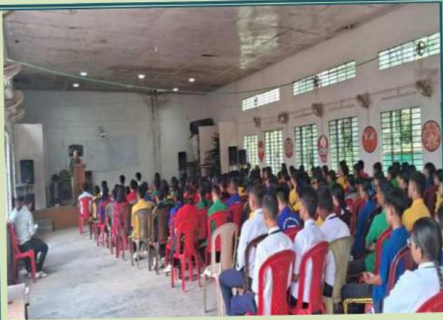
Government Senior Secondary School, Machong, Pakyong