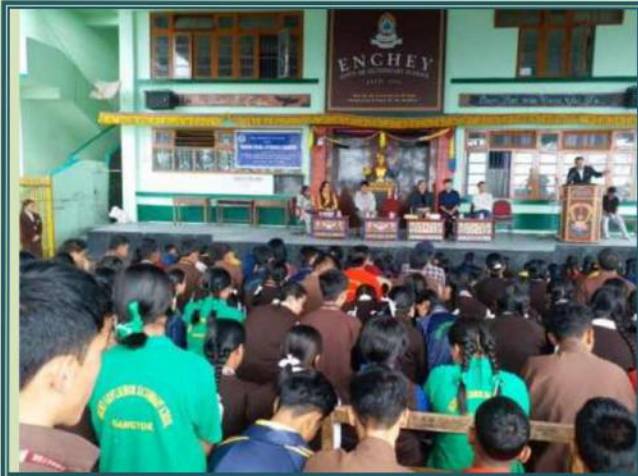
Government Senior Secondary School, Enchey, Gangtok District