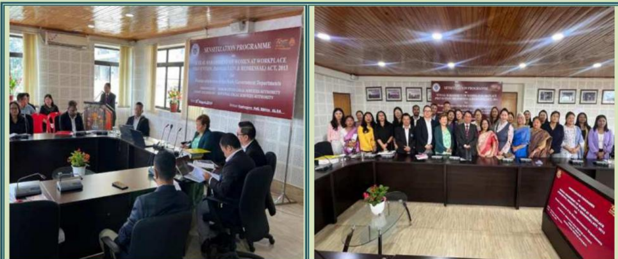
Sensitization Programme on Sexual Harassment of Women at Workplace (Prevention, Prohibition & Redressal) Act, 2013 for female employees and Members of Internal Complaints Committee of Sports and Youth Affairs Department, Government of Sikkim organized on 31 st August, 2024 at the Conference Hall of Sikkim SLSA, Development Area, Gangtok.

Under the directions of Hon'ble Mrs. Justice Meenakshi Madan Rai, Judge, High Court of Sikkim and Executive Chairperson, Sikkim State Legal Services Authority and also under NALSA Scheme for Para-Legal Volunteers (revised) & Module for the Orientation-Induction-Refresher Courses for PLV Training, three days refresher training programme for Convict Para-Legal Volunteers was organized by Sikkim SLSA for the convicts lodged at State Central Prison, Rongyek, Gangtok from 19 th to 21 st September, 2024 at the jail premises of State Central Prison Rongyek.