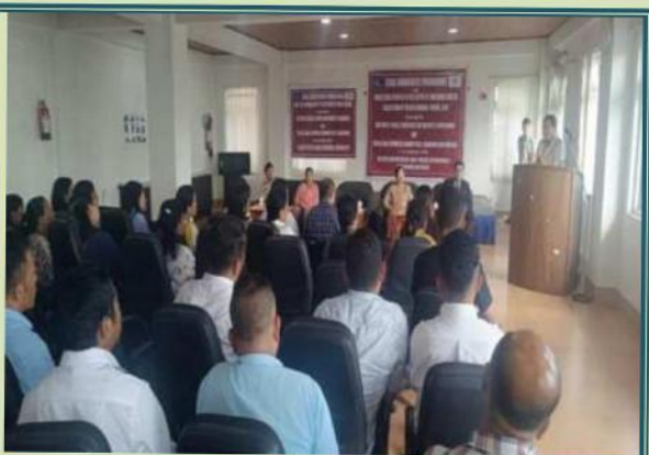
Hall of ADR Centre, Gyalshing District