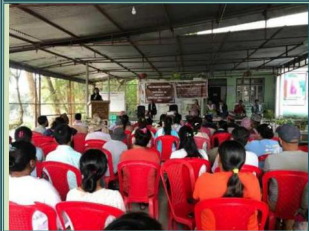
Government Arts College, Mangshila, Mangan District