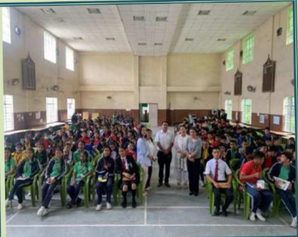
Government Senior Secondary School, Samdong, Gangtok