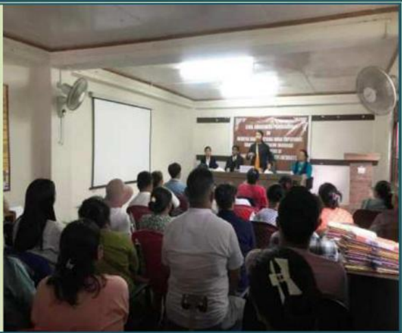
Singhik Sentam GPU, Mangan District