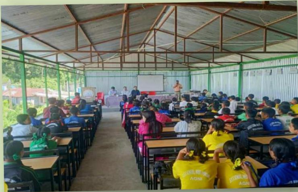
Government Secondary School, Syaplay Sardaray, Gangtok