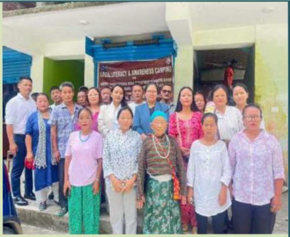
Samaj Ghar, Near Government Primary School, Tikjeck, Gyalshing District