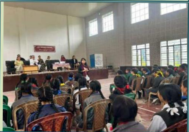
Government Secondary School, Singhik, Mangan District