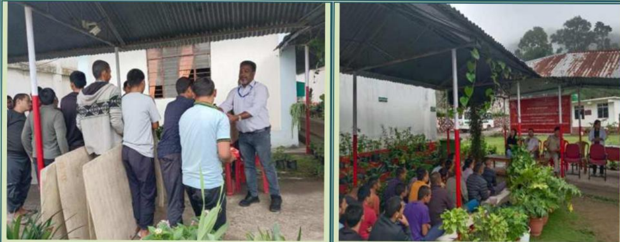
Mental Health Camp at District Prison, Boomtar, Namchi District on 20 th September, 2024