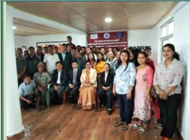
Dethang, 52-Barfung-Jarrong GPU, Ravangla, Namchi