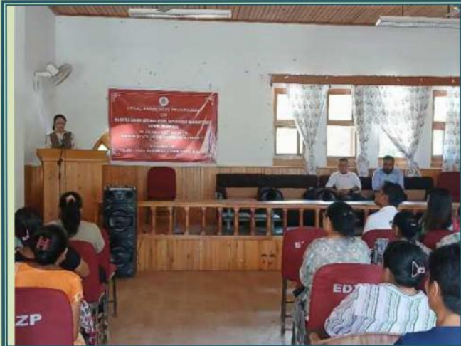
Block Development Office, Rongli, Pakyong District