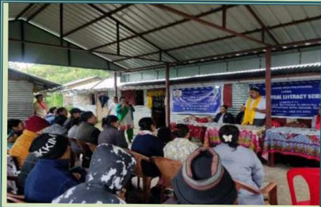
Lee Aal Sang Destitute Home, Tintek, Gangtok District