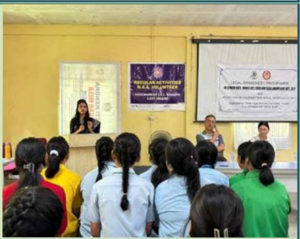
Industrial Training Institute, Rangpo, Pakyong District