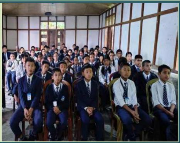
Government Secondary School, Chumbung, Gyalshing District