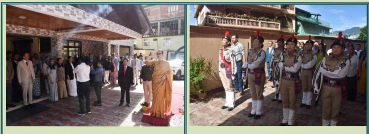
78 th Independence Day on 15 th August, 2024 in its office premises at Development Area, Gangtok

The programme has been uploaded in the official Facebook page and website of Sikkim SLSA.