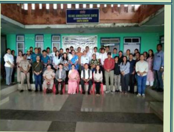
Village Administrative Centre, 10-Tanzi- Bikmat GPU, Namchi District