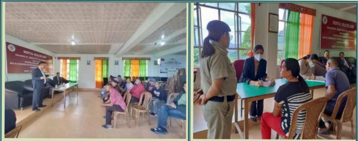
Mental Health Camp at State Central Prison, Rongyek, Gangtok District on 20 th September, 2024

During these camps, the Convicts and Under Trial Prisoners undergoing medical treatment for mental health issues were examined and other Convicts and Under Trial Prisoners suffering from various mental issues were provided counselling by the Psychiatrists and Clinical Psychologists and medicines were also prescribed to them.