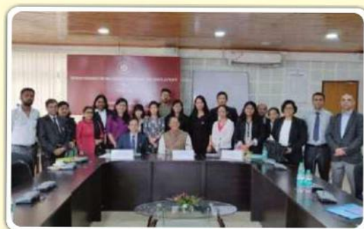
Training Programme for Panel Advocates and members of the Bar on 20 th July, 2019