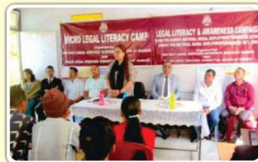
Government Junior High School, Salleybong