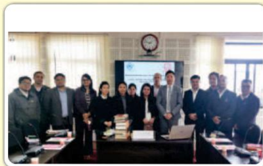
Training Programme for Remand Advocates on 30.09.2019

12 nos. of Remand Advocates were trained during the said programme.