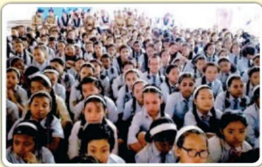
Jawahar Navodaya Vidyalaya, Rothak