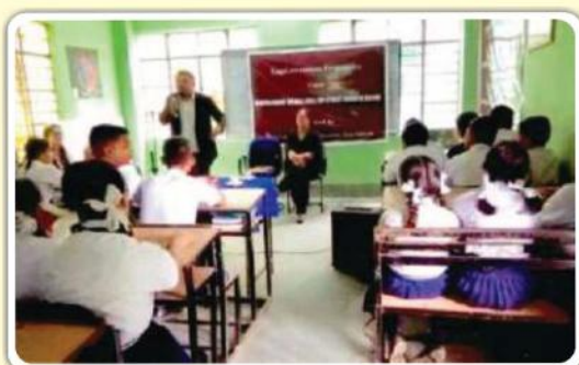
Government Secondary School, Sirwani