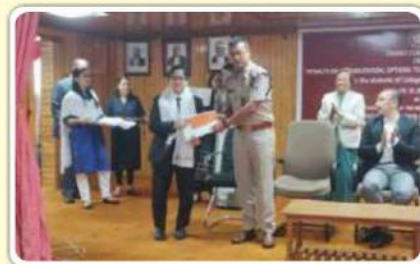
1st Position (i)