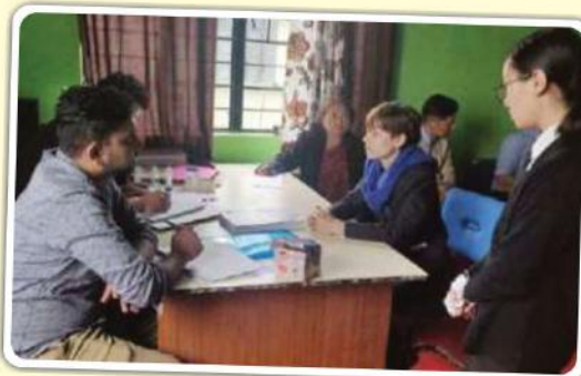
Mission Mode Campaign for Prevention & Eradication of Tuberculosis in all Educational Institutions in Sikkim