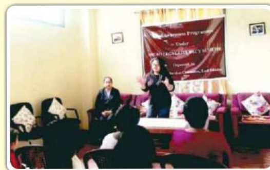
Mamtalaya (Swadhar Greh), Lower Burtuk