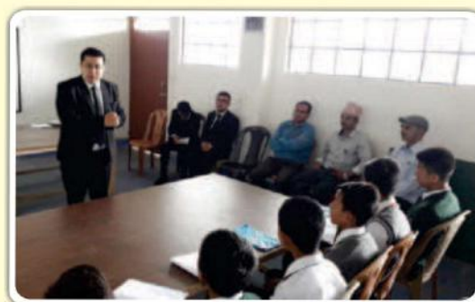
Government Senior Secondary School, Lingchom