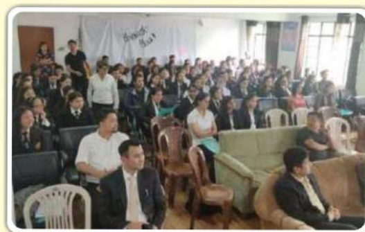
An Awareness Lecture for the Students of College & University on 12 th September, 2019 in the Moot Court Hall of Sikkim Government Law College, Burtuk, East Sikkim.