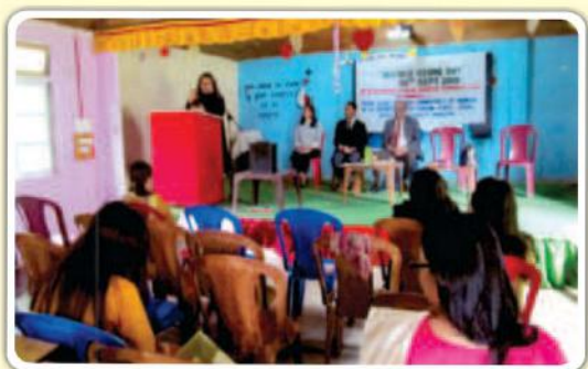
Government Senior Secondary, Maniram