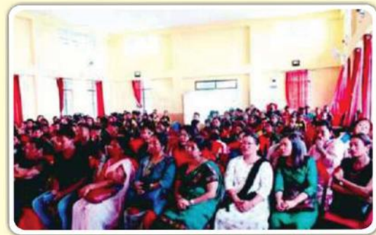
Government Secondary School, Soreng