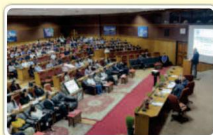
A sensitization programme on Juvenile Justice (Care & Protection of Children) Act, 2015 and POCSO Act, 2012