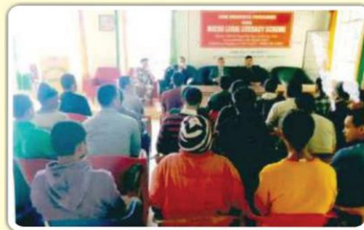
State Central Prison, Rongyek.