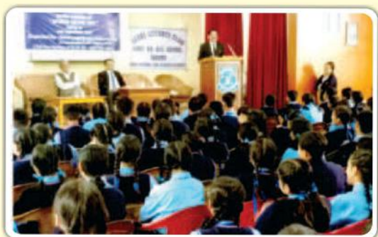
Government Senior Secondary School, Tadong