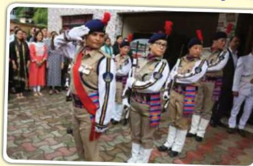
Celebrations of Independence Day in the Office premises at Development Area, Gangtok