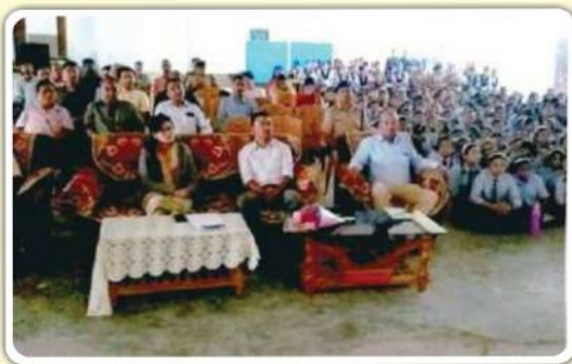
Government Secondary School, Pakki Gaon