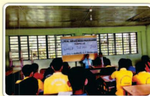
Government Senior Secondary School, Mangan