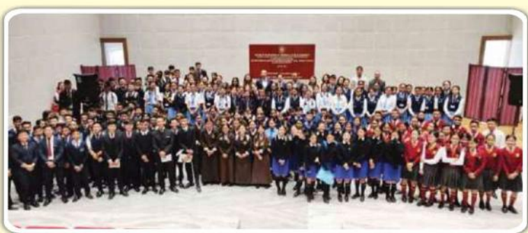
Students of Legal Literacy Clubs in Schools of East District