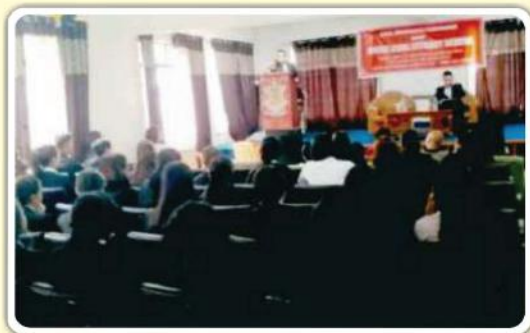
Government Law College, Burtuk.