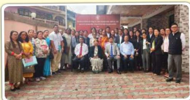
Sensitization programme on SADA, 2006 (as amended), Narcotic Drugs, Psychotropic Substances Act, 1985 and Victim Compensation Scheme (as amended) for Panel Advocates and Para-Legal Volunteers of the East District