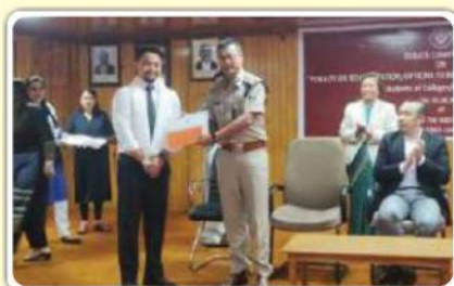
1st Position (ii)