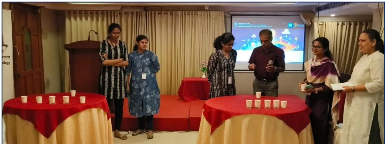
Game arranged during the Cultural Event