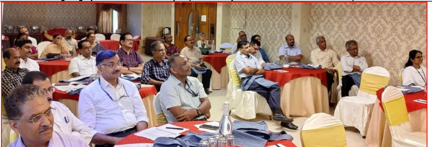
Participants during the DIO Workshop 2023