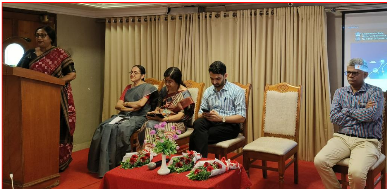
Photo: Introductory Address by Dr. Suchitra Pyarelal, DDG & SIO Kerala during the inaugural session of DIO Workshop 2023.

been the flag bearers of the ICT services at the grassroots leading to an efficient lastmile delivery of government services. SIO also added that the district centres of NIC Kerala have emerged as a reputable institution driving the transformative progress in the district with the unwavering dedication and steadfast commitment of officers. The workshop was to enable them to make innovations at the grassroots level.