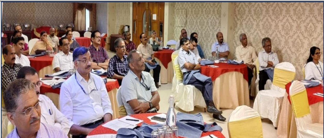
Photo: District Officials during session on HOGs interaction