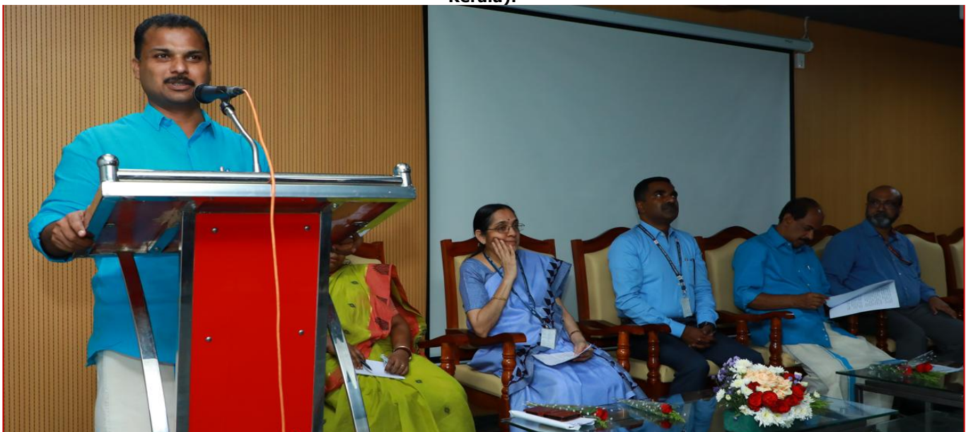
Photo: Adv. V K Prasanth, Hon'ble Member of Legislative Assembly (Vattiyoorkavu Constituency) during the inaugural function.