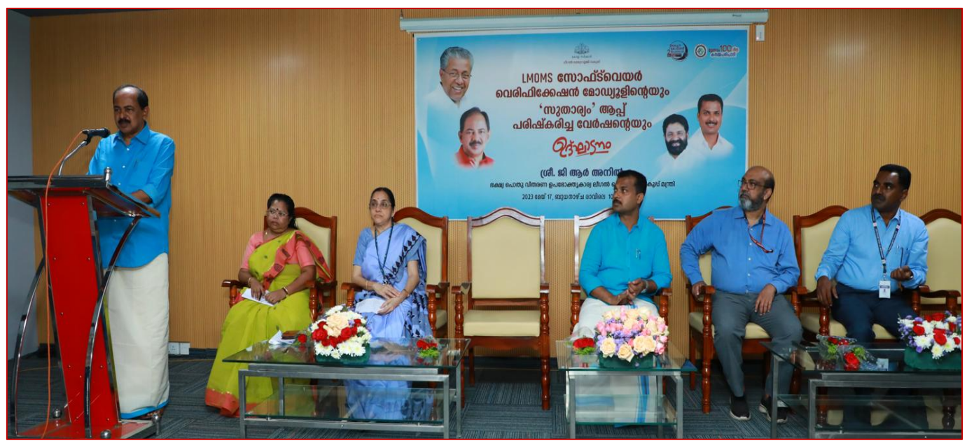
Photo: Adv. G R Anil, Hon'ble Minister for Food, Civil Supplies, Consumer Affair and Legal Metrology, Government of Kerala during the inaugural Address in presence of Smt. Asha Varma K C, DDG & ASIO(NIC Kerala).