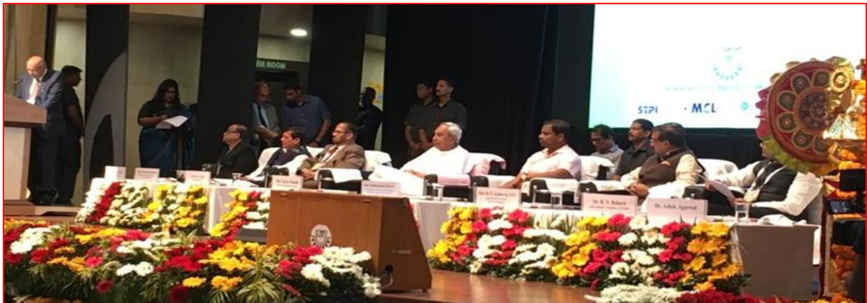
Photo: Dignitaries during the CSI SIG Awards 2019 Ceremony.