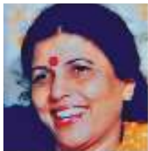
Dr. Indira Hridayesh