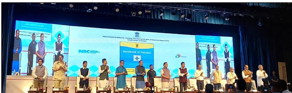
Inauguration of Handbook of Pension (under Kritagyata Project) by Hon'ble CM of Assam