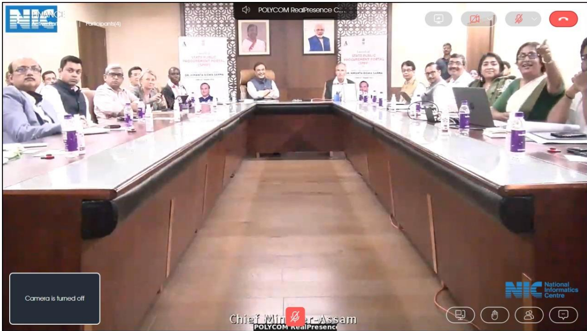
Discussion on the features of the SPPP