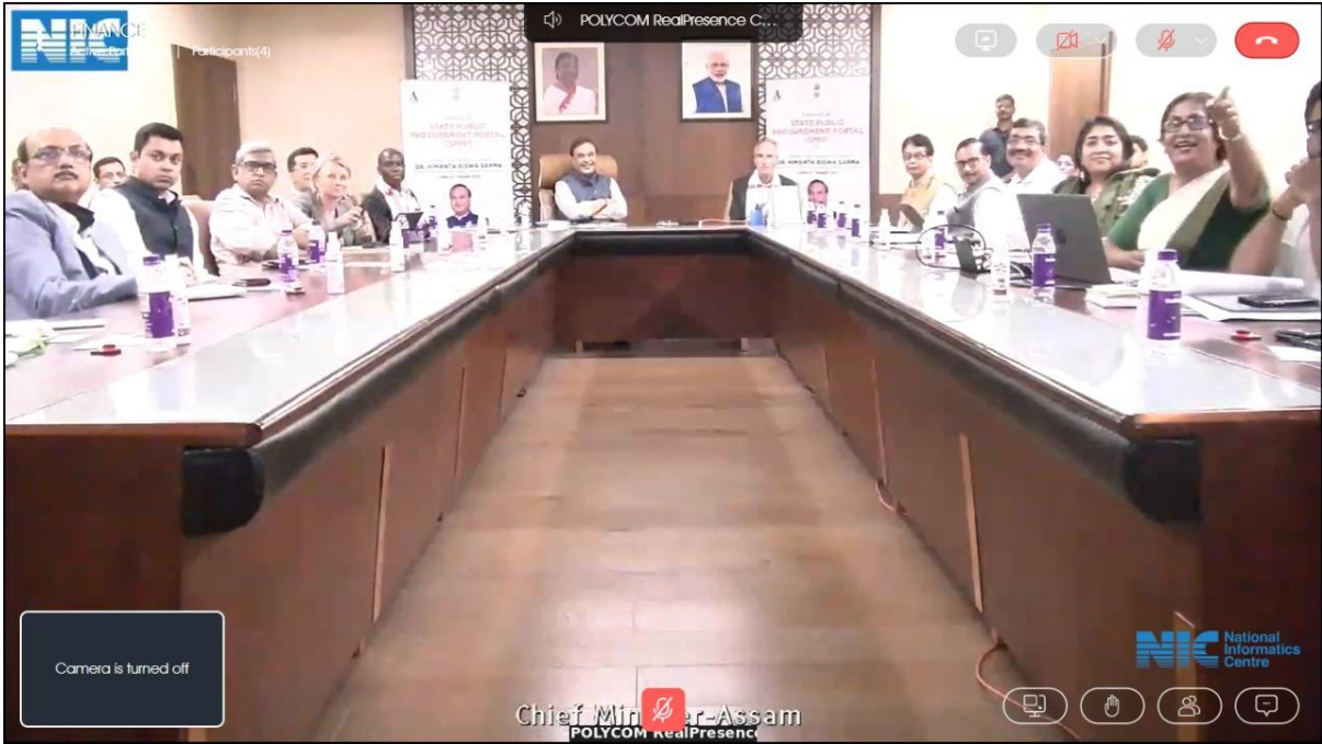
Discussion on the features of the SPPP