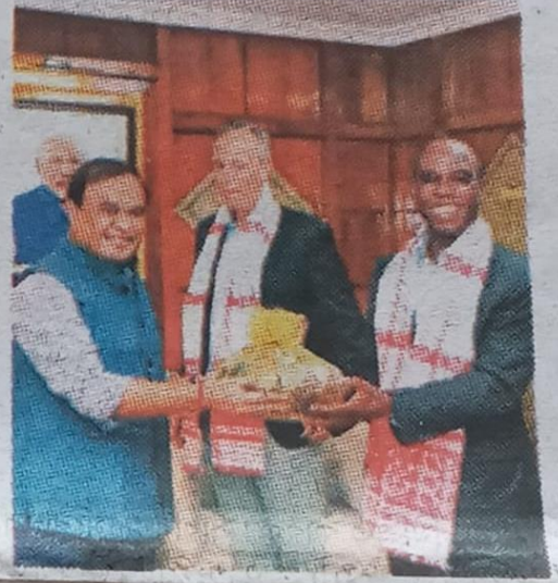
Newspaper Report in Assamese-language newspaper