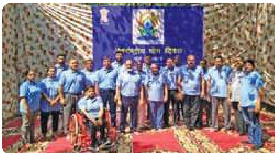
Officers/Staff Members of the O/o CCPD during Yoga Day Celebration on 21st June 2019 at CCPD Premises