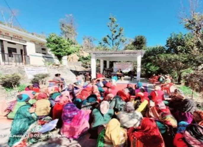
Page | 6 [Voters' Day Campaign]