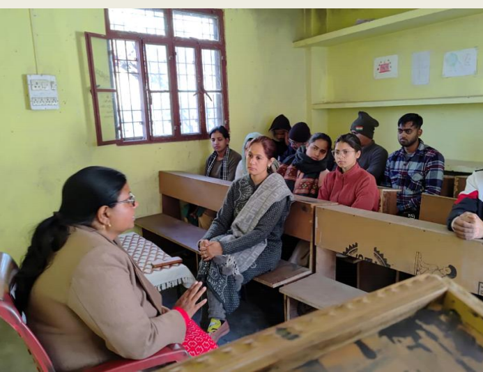
Page | 8 [Voters' Day Campaign]