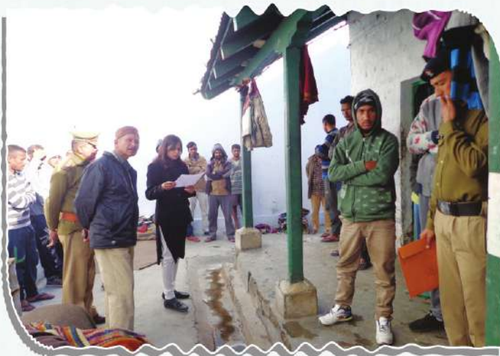
Visit of Judicial Lock-up by Secretary, DLSA, Pithoragarh