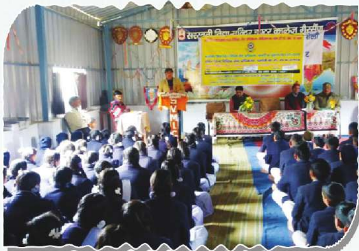
Legal awareness camp on 21.1.2017 at Gairsain, Chamoli