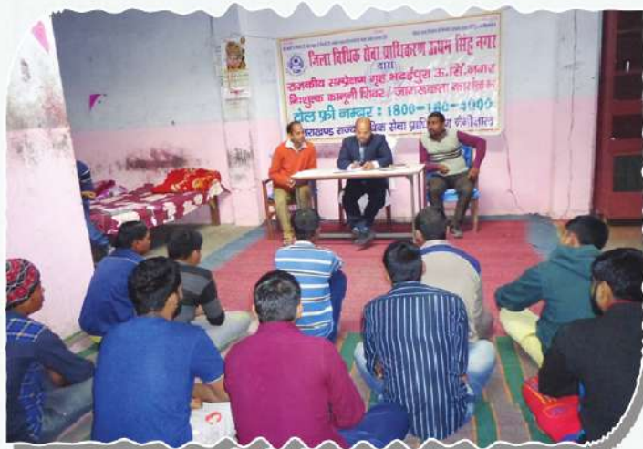
Secretary, DLSA, USN visiting Observation Home