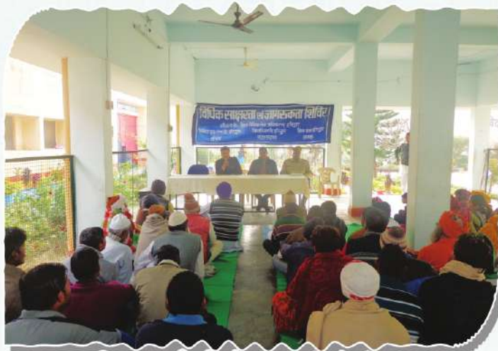
Jail camp at Haridwar