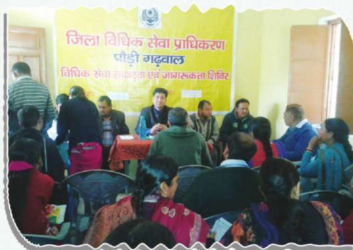
Legal awareness camp on 6.1.2017 at Lansdowne, Paurijpg