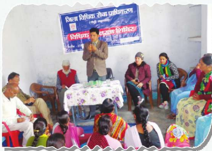
Awareness camp on rights of asid attack victims