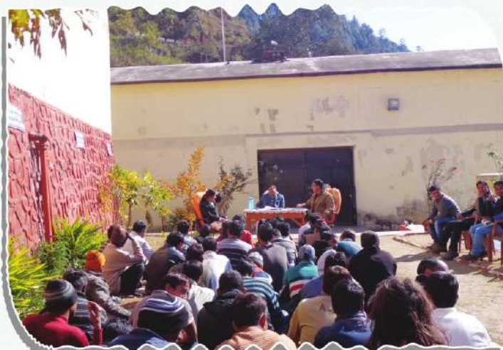
Secretary, DLSA, Chamoli during jail visit