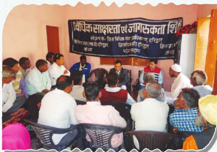
DLSA, Secretary, Haridwar interacting with needy people