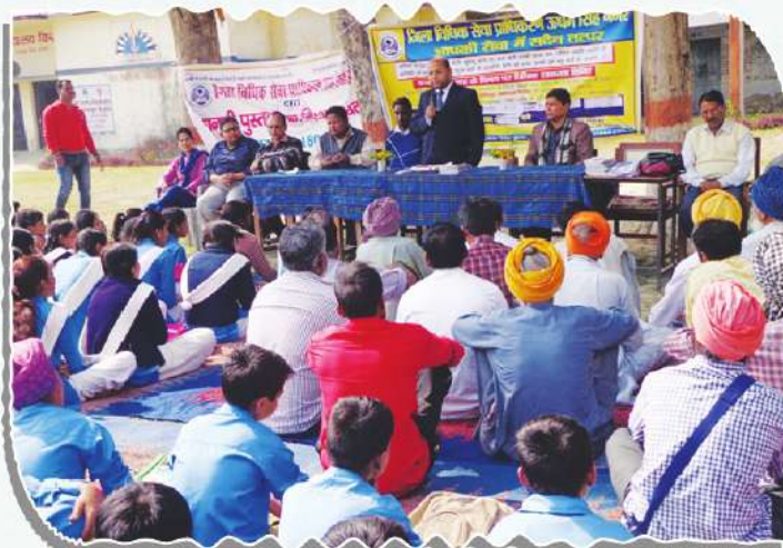
Awareness Camp on 20.02.2017 at Bichva, USN