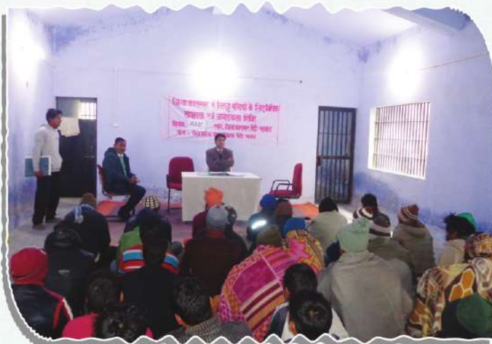
Camp for rights of mentally ill persons