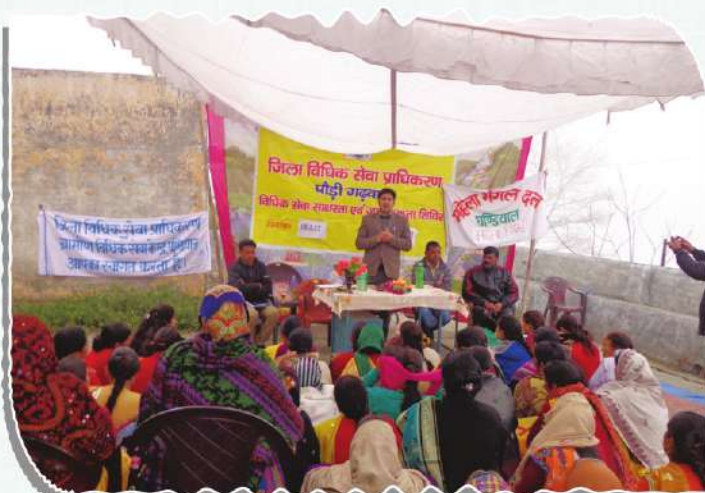
Celebration of International Women Day on 8.3.2017