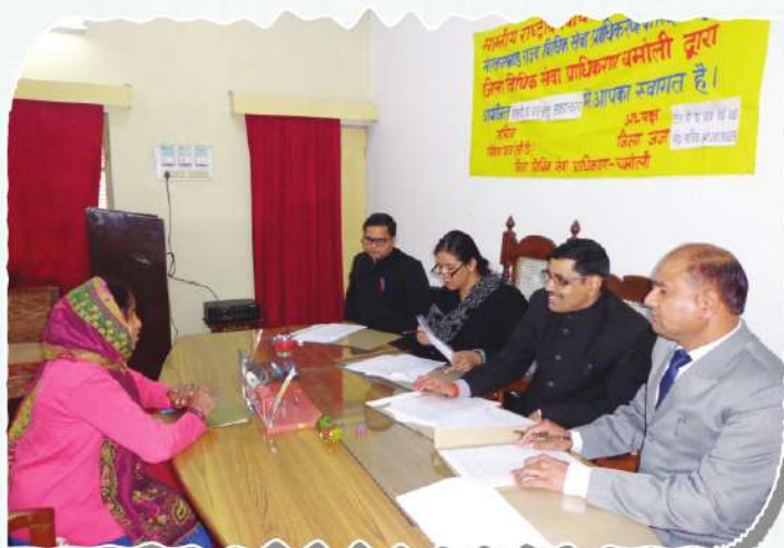
Chairperson, DLSA, Chamoli during interview of PLVs