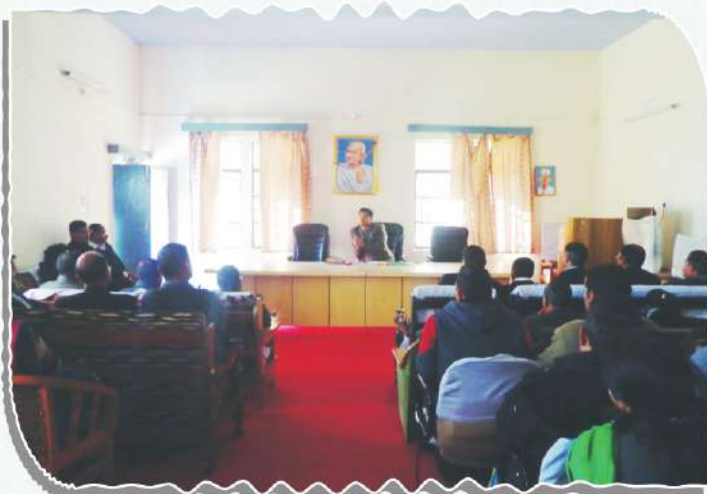
Secretary, DLSA, Pauri interacting with PLVs