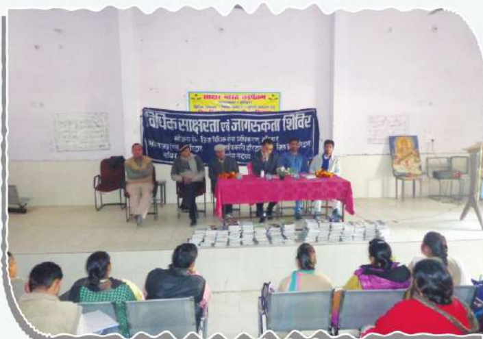
Secretary, DLSA, Haridwar during awareness camp on 6.2.2017