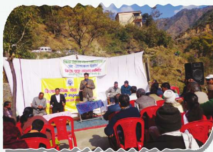
Secretary, DLSA, Pauri spreading awareness