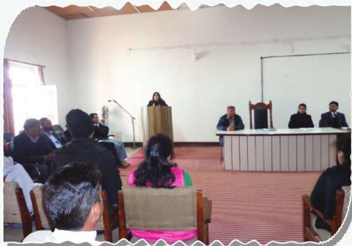
Secretary, DLSA, Pithorgarh sensitizing the people