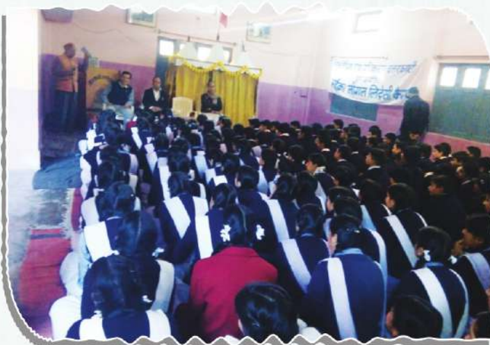
Students participating in legal awareness camp in Distt. Uttarkashi