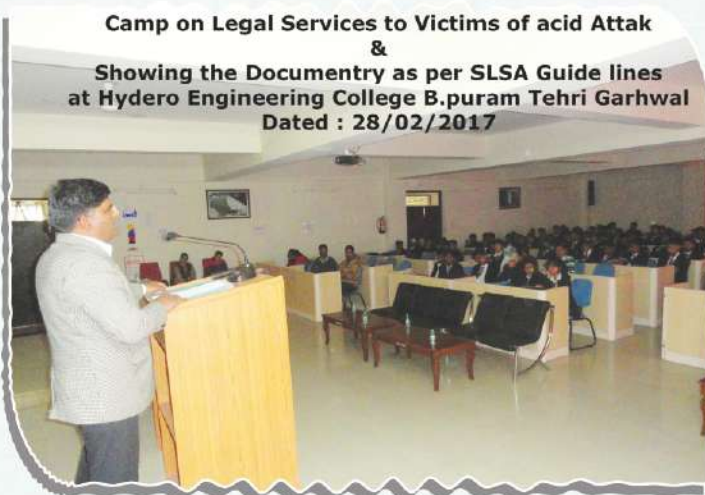
Camp on Legal Services to Victims of acid Attak & Showing the Documentary as per SLISA Guide lines at Hydero Engineering College B.puram Tehri Garhwal Dated : 28/02/2017