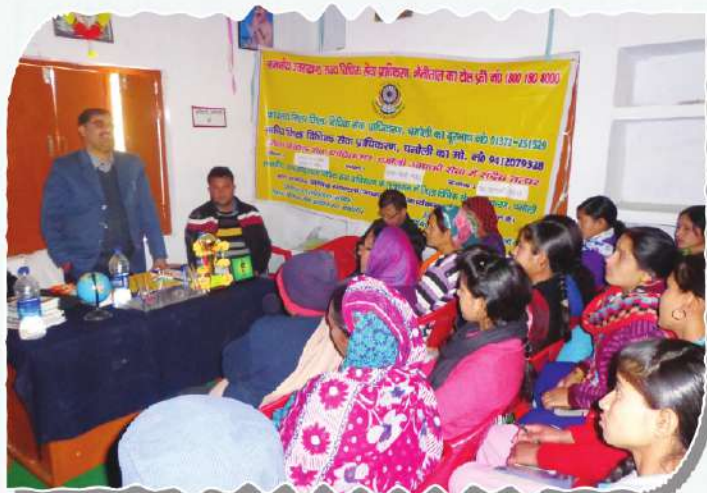
Secretary, DLSA, Chamoli making awareness on NALSA schemes