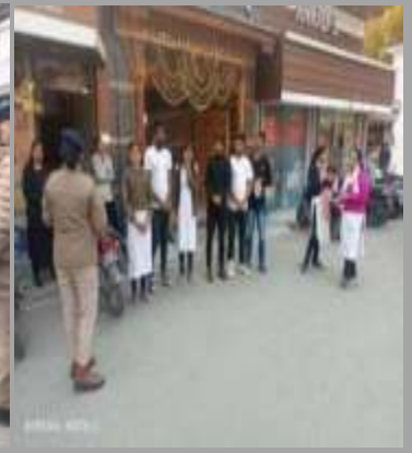
Secretary, DLSA Uttarkashi organized a Legal Awareness Camp Regarding Uttarakhand Compensation Scheme for Women Victims/Survivors of Sexual Assault/Other Crime, 2020 in District Court V.C. Hall on 27.03.2024.