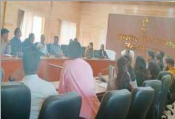
Secretary, DLSA Pithoragarh aware Border Security Force Personnel about PoSH Act at Aincholi, Pithoragarh.