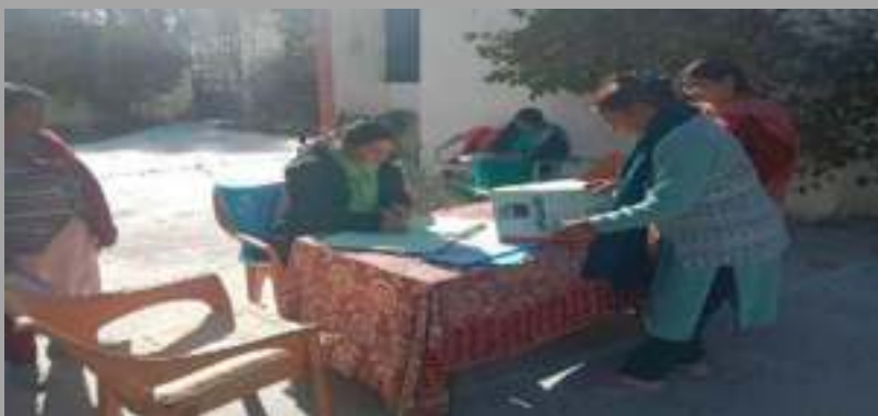
Visit of Legal Aid Clinic by the Secretary, DLSA Almora on 31.01.2024