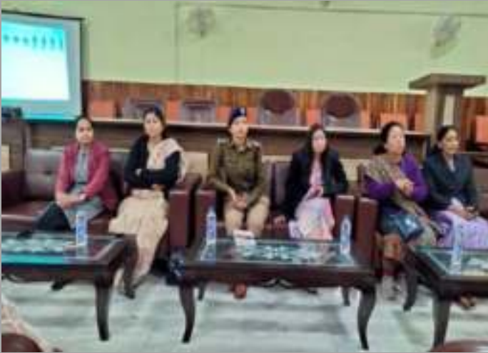
Retainer Lawyer, DLSA Pithoragarh attend meeting organized for Mental Health Check up in March, 2024