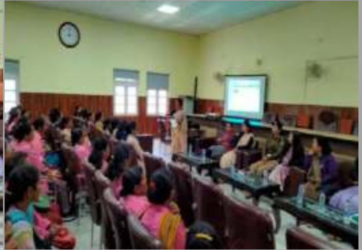
Secretary, DLSA Pithoragarh aware the women from different strata of society about PoSH Act.