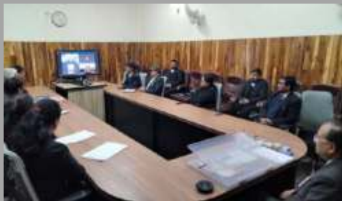
National Lok Adalat organized at District Court Pithoragarh on 09.03.2024.