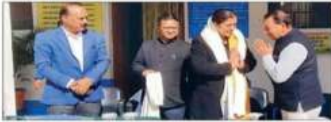
कार्यक्रम के दौरान आयोजित व प्रतिक्रिया।