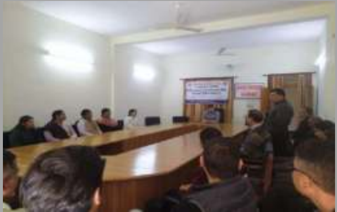
Legal Awareness Camp was held on 08.01.2024 at Govt. GIC Bageshwar on "NALSA (Legal Services to the Victims of Drug Abuse Scheme, 2015

Legal Awareness Camp was held on the Subject "Provisions of Sexual Harassment of women at workplace (prevention, prohibition and Redressal) Act, 2023 (PoSH Act.)" by Secretary, DLSA, Bageshwar