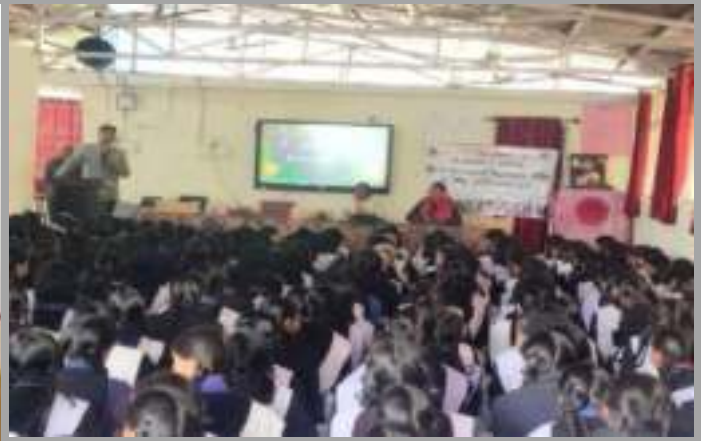
DLSA, Bageshwar organized awareness camp on 09.01.2024 to aware the people about "e-True Copy Module, e-Sewa Kendra, e-Filing of cases".