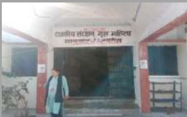
Visit of Shishu Sadan, observation home by the Secretary, DLSA Almora on 28.02.2024

Secretary DLSA, Almora inspected Special Home Kishori and Nari Niketan, Bakh on 10.01.2024 under the ongoing massive awareness campaign in District from 01.01.2024 to 15.01.2024 against Drug Menace organized a legal awareness camp there and made persons aware about the ill effects of drugs etc. Later on, visited Legal Aid Clinic.