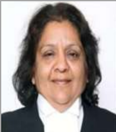
Hon'ble Ms. Justice Ritu Bahri Hon'ble Patron-in-Chief, UKSLA, Nainital