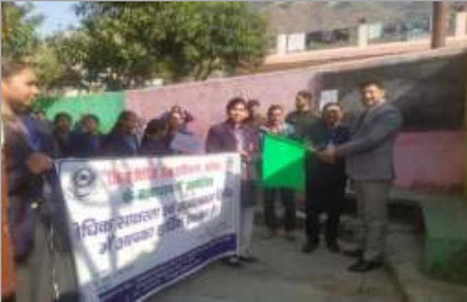
Monthly Meeting with PLVs and Panel Lawyer convened on dated 06.01.2024 by Secretary, DLSA, Bageshwar

Awareness Rally on 05 & 09.01.2024 for "NALSA (Legal Services for Victims of Drug Abuse and Elimination of Drug Menace) Scheme, 2015" by DLSA, Bageshwar.