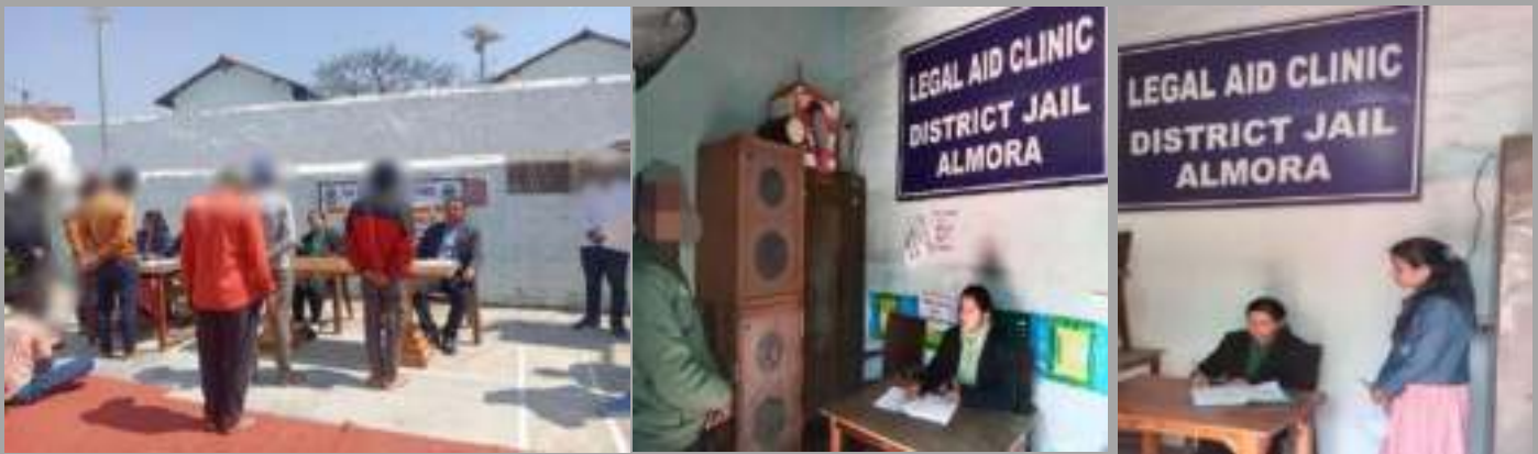
5 Days vocational training of pickle and juice making was organized by secretary DLSA, Almora during February, 2024 for jail inmates in District jail Almora in collaboration with Public Education Institute Almora (Dharanula).