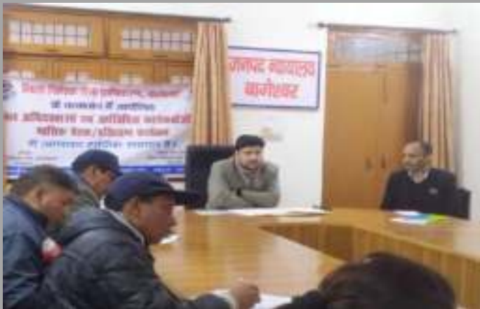
Meeting & Training with JJB, SJPU & CWC members on dated 09.01.2024 in Tehsil Auditorium Bageshwar by DLSA, Bageshwar