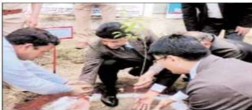
जिला न्यायालय परिसर में पौधरोपण करते जिला जज।

नई टिहरी/एसएनबी। विश्व पर्यावरण दिवस के मौके पर विभिन्न सरकारी कार्यालयों द्वारा पौधरोपण किया गया।