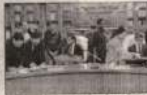
लोक अदालत में 19923 वादों का निस्तारण

राष्ट्रीय विधिक सेवा प्राधिकरण (राष्ट्रीय विधिक सेवा प्राधिकरण) के निर्देश पर सुलह-समाप्ति करवाकर जसूलो धनराशि