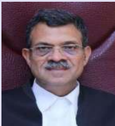
Hon'ble Mr. Justice Vipin Sanghi Hon'ble Patron-in-Chief, UKSLA, Nainital