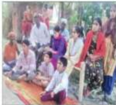
जलपुर के ग्राम हर्षोद्वारा में आयोजित जनसुलभ विधिक शिविर में भाग लेते लोग।