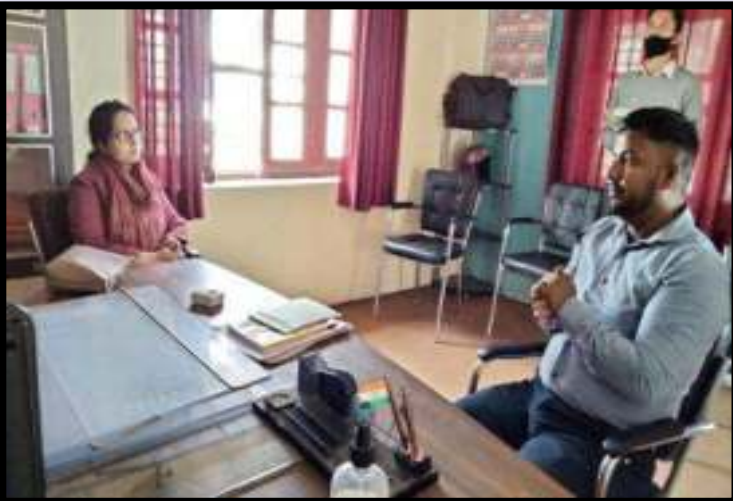
Secretary, DLSA Pithoragarh visited Workers Facilitation Center