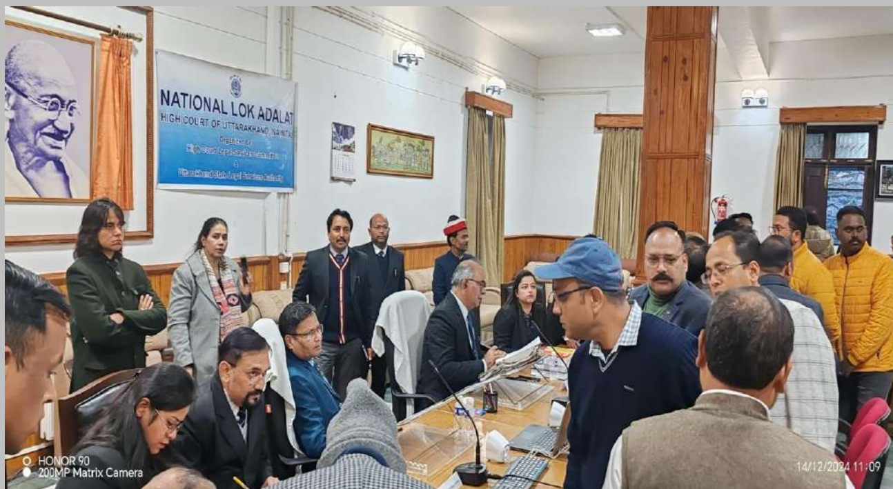
National Lok Adalat was organized on 14 th December, 2024 in District Courts and Outlying Courts across the State.