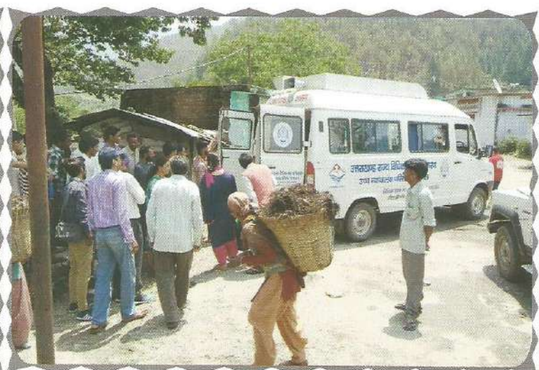
People showing interest during mobile van visit