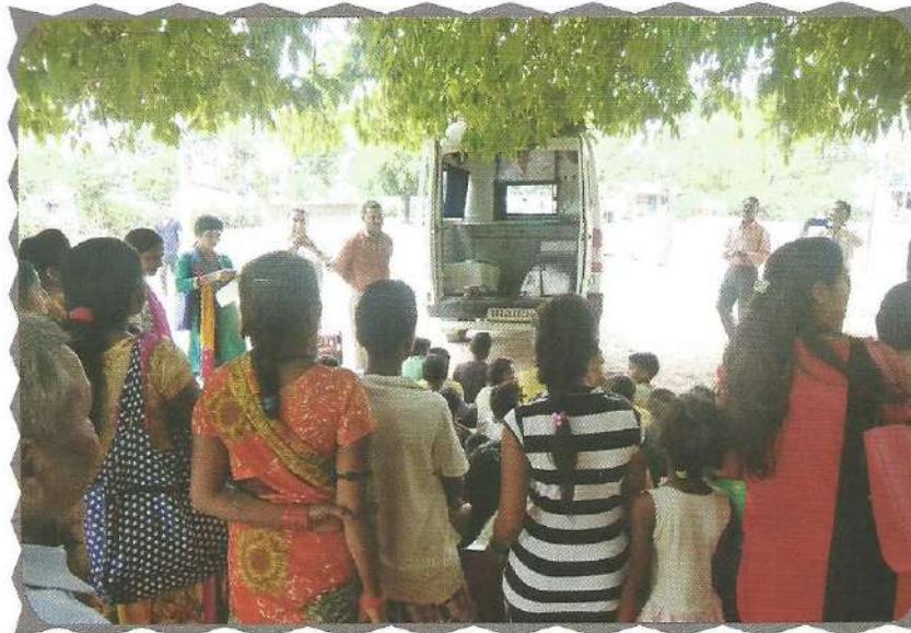
People watching documentary film

To provide legal aid and advice to the common people at their doorsteps, legal awareness and sensitization camps are being organized through mobile van throughout the State for cluster of villages in different districts. During the months of January, 2018 to June, 2018, State Legal Services Authority's mobile van visited District-Dehradun, Bageshwar and Uttarkashi covering 55 places whereby 22,151 persons were benefited. During the mobile lok adalat, 47 cases were taken up, out of which 18 cases were settled and amount of Rs. 2,85,150/- was also settled.