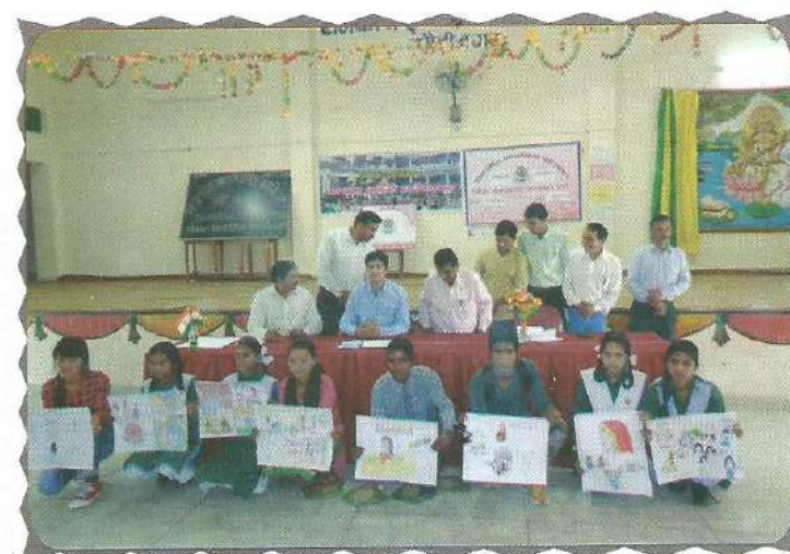
Secretary, DLSA, Pauri Garhwal during painting competition (1)