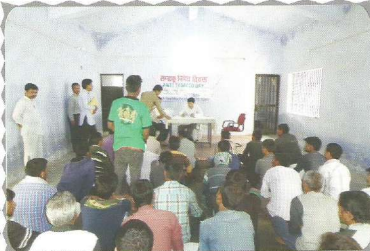
Celebration of Anti Tobacco Day at Pauri Garhwal