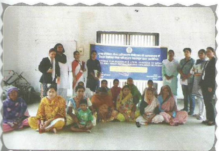
Campaign for enhancing legal services to women prisoners and their children