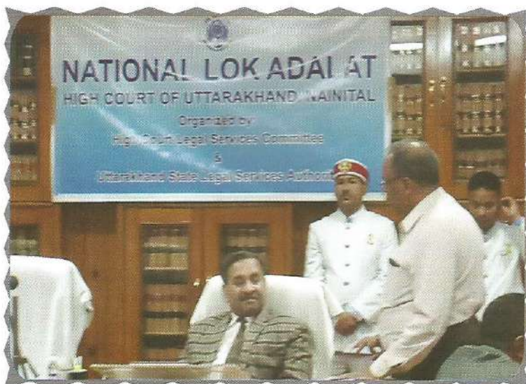
Hon'ble Mr. Justice Sharad Sharma interacting with parties during NLA

In these National Lok Adalats, a total number of 19,039 cases were taken up and out of them 6022 cases were settled amicably. Amount to the tune of Rs. 26,89,16,242/- was also settled.