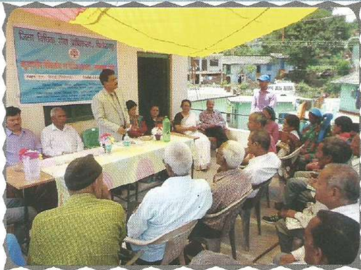
Secretary, DLSA, Pithoragarh during Multi-purpose camp