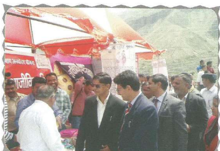
Chairperson, DLSA, Chamoli during New Model Camp