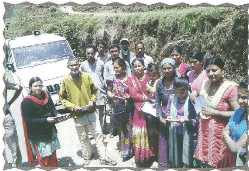
Distribution of legal informative booklets

In the said camps documentary films on the subjects of mediation, lok adalat and legal aid prepared by National Legal Services Authority and State Legal Services Authority were displayed. The queries raised by the villagers were also resolved on the spot. The applications were also received for legal aid which were either disposed of at the level of State Authority or were sent to the authorities concerned for appropriate and necessary action.