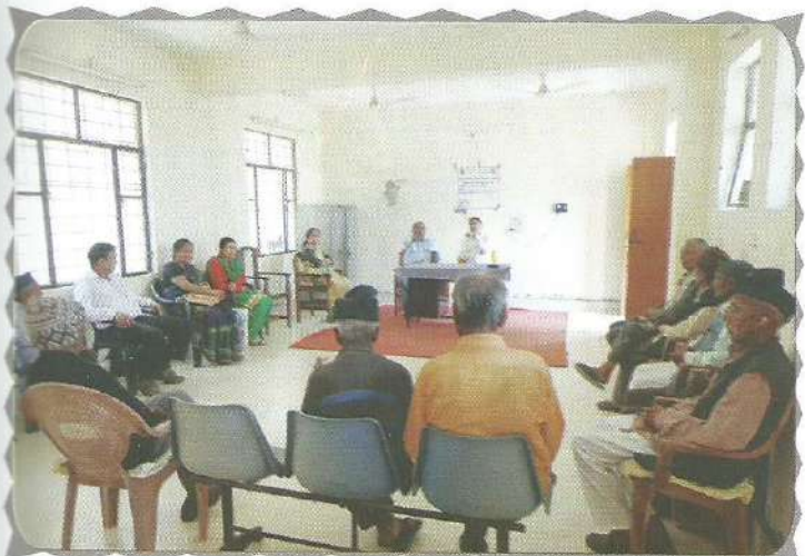
Secretary, DLSA, Chamoli sensitizing Senior Citizens