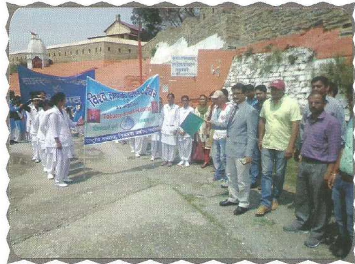
Rally on World No Tobacco Day at Pithoragarh