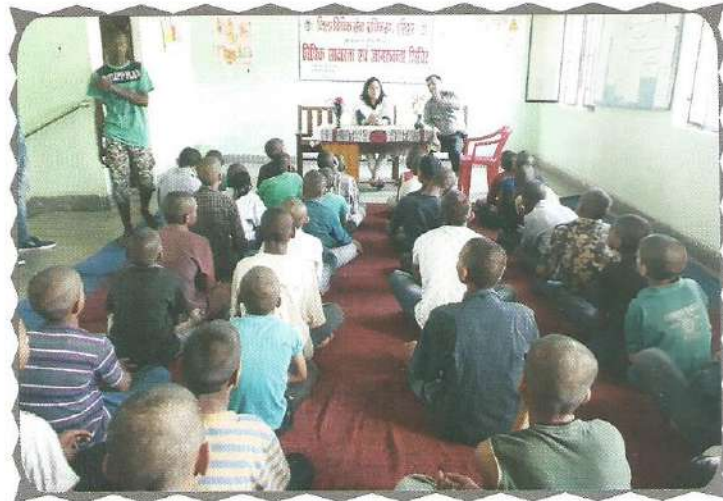
Visit of Government Children Home by Secretary, DLSA, Haridwar