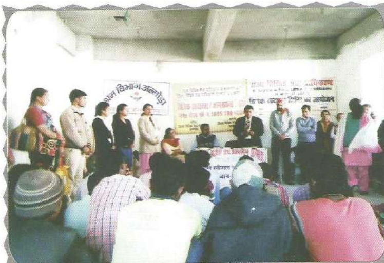
Secretary, DLSA, Almora during World Child Labour Day