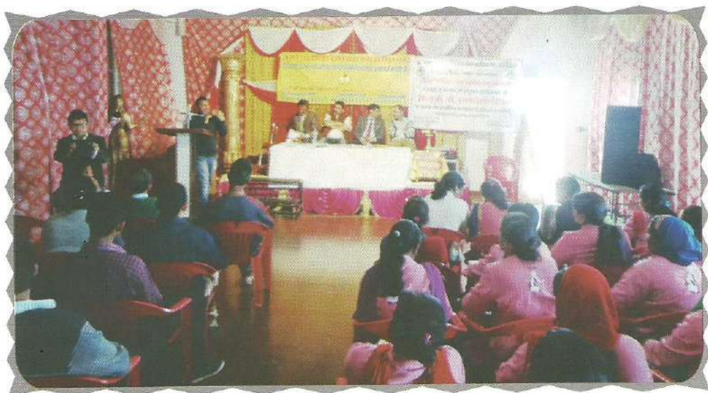
Observation of World Tuberculosis Day at Gopeshwar

Also, the people at large were made aware about the nine schemes launched by National Legal Services Authority by organizing legal awareness camps, programmes and seminars.