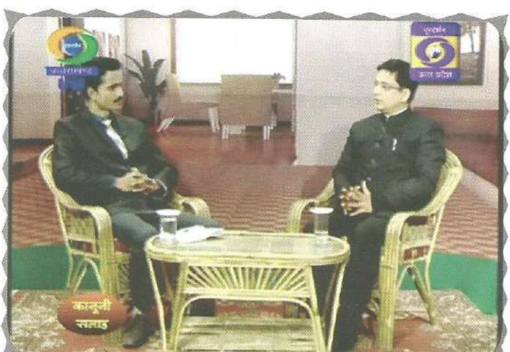
Secretary, DLSA, Dehradun during programme on Doordarshan