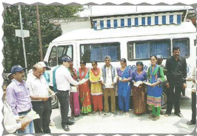
Secretary, DLSA, Uttarkashi during mobile van visit