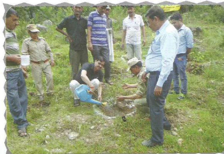
Plantative Drive during Environment Day