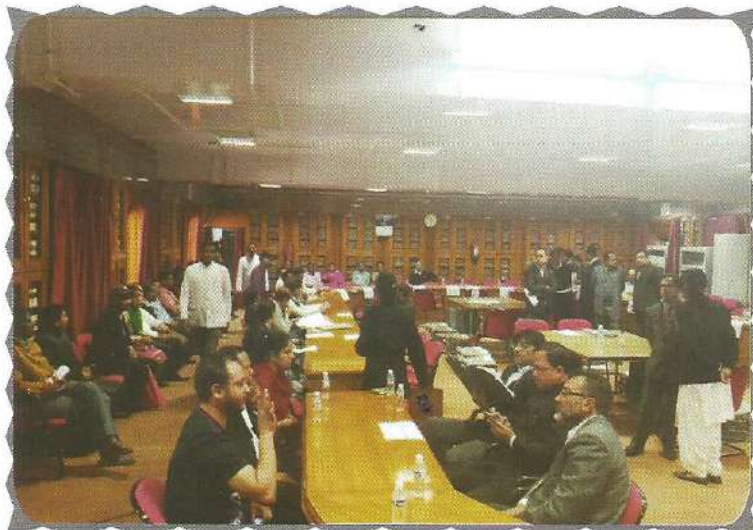
Judicial Officers, Advocates and Litigants during NLA