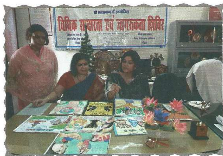
Painting Competition on Women Rights at Haridwar