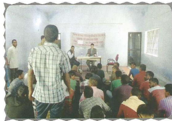
Secretary, Pauri Garhwal interacting with jail inmates