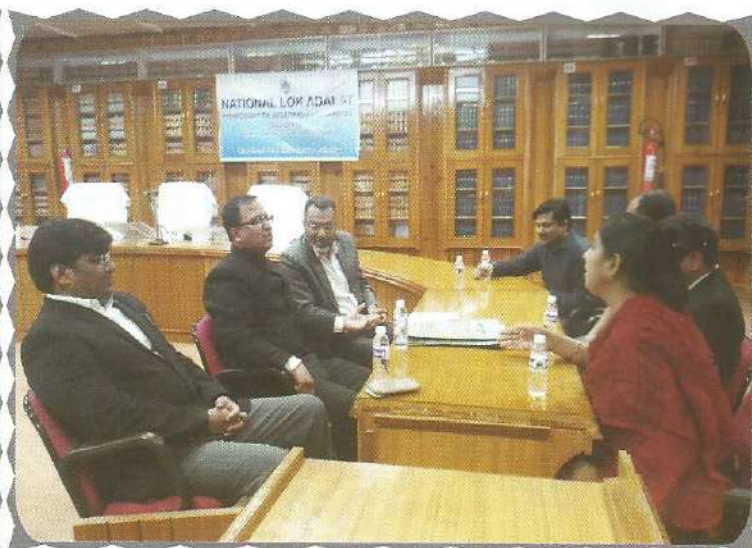
Registrars of the Hon'ble Court settling the disputes