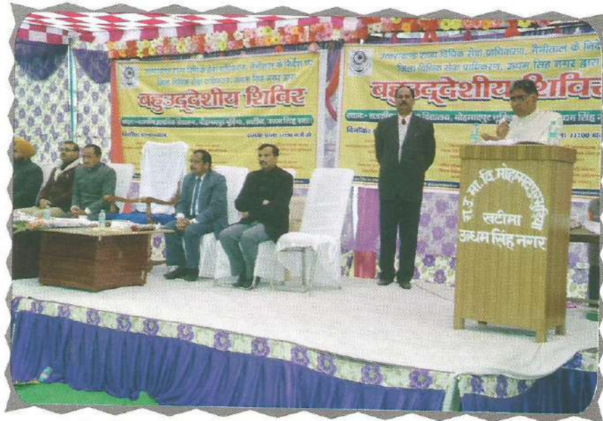
Hon'ble Executive Chairman, UKSLSA sensitizing the people

In order to propagate legal awareness among the common people about their legal rights, Government welfare schemes available to them and the legal activities being run by the legal services institutions, the Uttarakhand State Legal Services Authority first identified common problems of people at large in cluster of villages/places in the districts and then organized 49 Mega Legal Literacy and Awareness Camps thereon in coordination with various Government Departments benefitting 56,603 people. The said camps were based on the NALSA's newly designed camp module focusing on upliftment and empowerment of tribal people, poverty alleviation and public awareness, empowerment of labourers of unorganized sector, women and child welfare & protection, right of education, rights of senior citizens as well as introduction and implementation of various public welfare schemes.