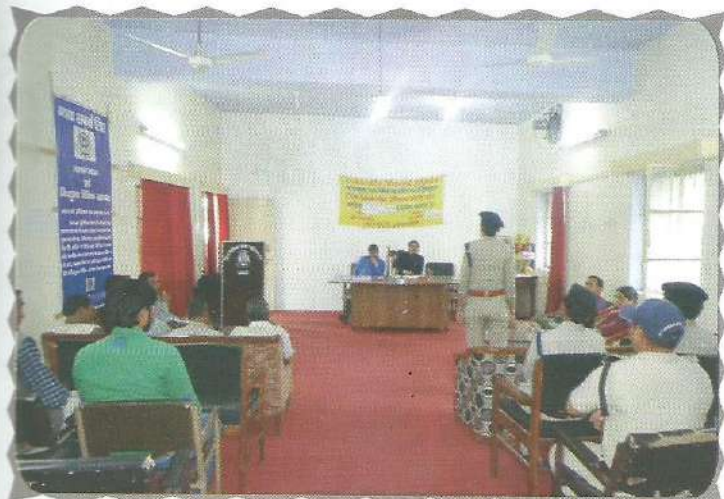
Meeting on issues relating to juveniles justice act at Chamoli