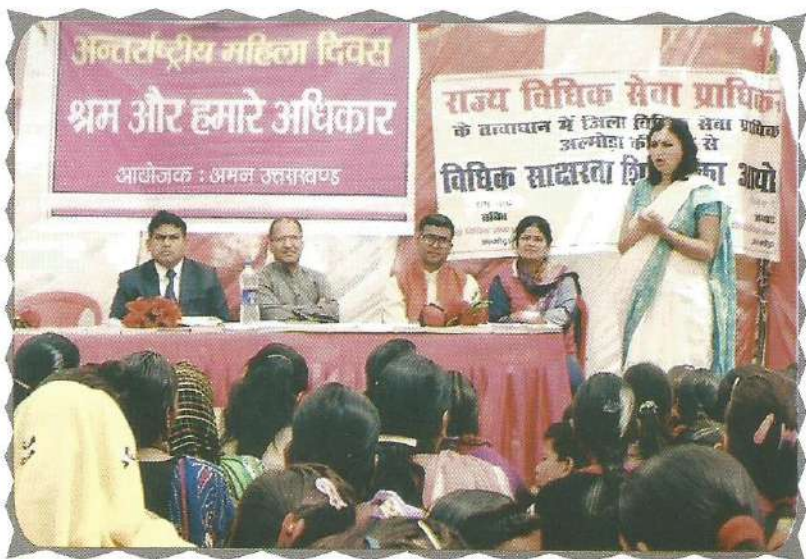
Celebration of International Women Day at Almora

Between the months of March, 2018 to June, 2018, International Forest Day, World Water Day, World Tuberculosis Day, Labour Day, Anti Tobacco Day, Environment Day, World Day against Child Labour, World Blood Donational Day and International Day against Drug Abuse and Illicit Trafficking were observed throughout the State. During these occasions, 686 special legal literacy and awareness camps were organized wherein 50,734 people got benefitted.