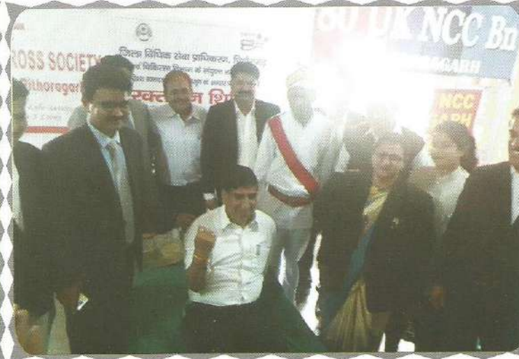
Chairman, DLSA, Pithoragarh during Blood Donation Day