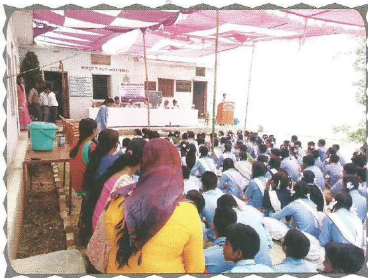
Sensitization camp on Illegal Trafficking at Jamnikhal, Tehri Garhwal