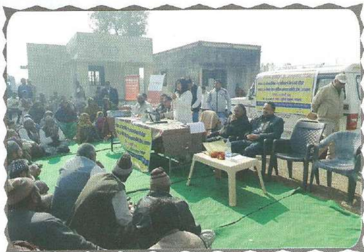
Secretary, DLSA, Haridwar sensitizing the people about their legal rights