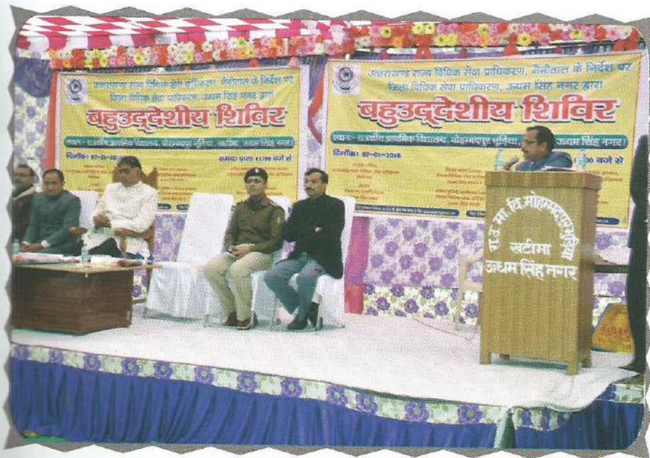
Member Secretary, UKSLSA during mega camp

Some of the camps were presided by the Hon'ble Executive Chairman, Uttarakhand SLSA and various authorities from different department sensitized the common people about the welfare schemes and also they were also provided the benefits on the spot. In these mega camps, District Administration also issued the Aadhar cards, disability certificate, pension certificates to the Widows and Old age Persons. The medical check-up was done on the spot and free medical and subsidized agriculture equipments were also distributed to the needy