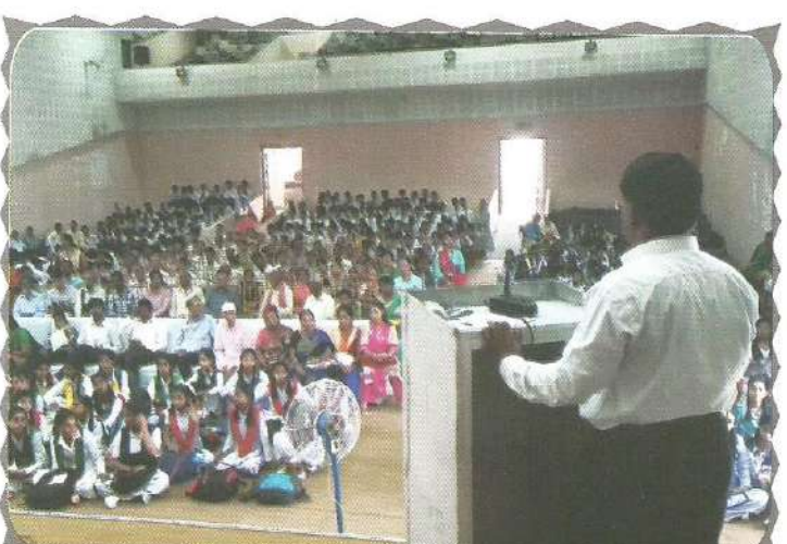
Secretary, DLSA, Dehradun addressing the people in Mega Camp