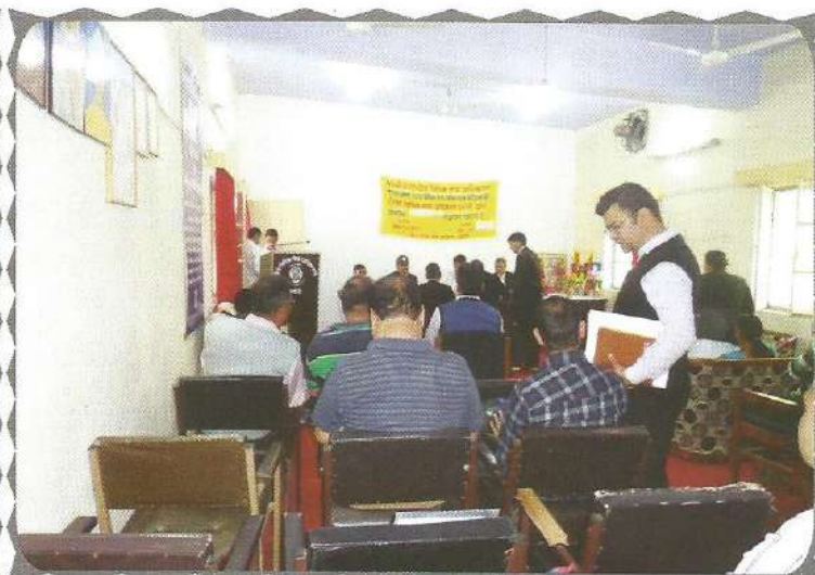
National Lok Adalat at District Court, Chamoli