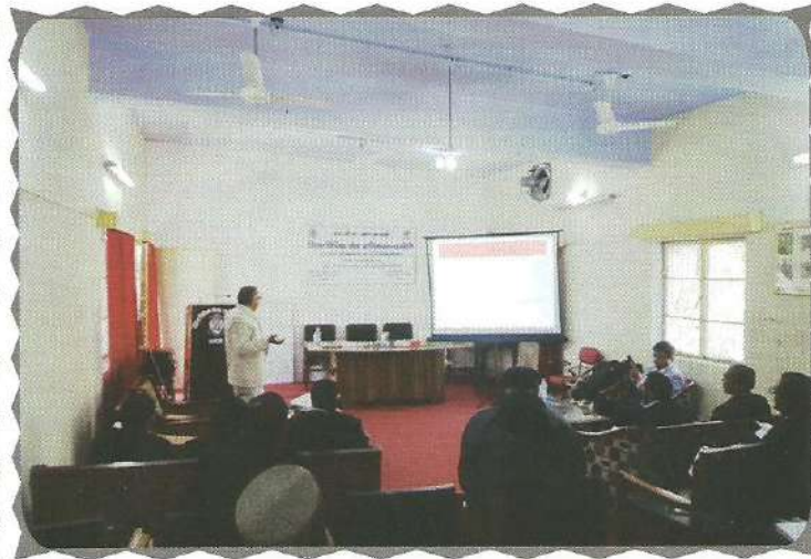
Training of Panel Lawyers at Chamoli

of Garhwal Region. In the said training programmes, total 279 panel lawyers engaged by seven DLSAs of Garhwal Region have been imparted training by the Member Secretary, Uttarakhand State Legal Services Authority and two Master Trainers (Advocates).