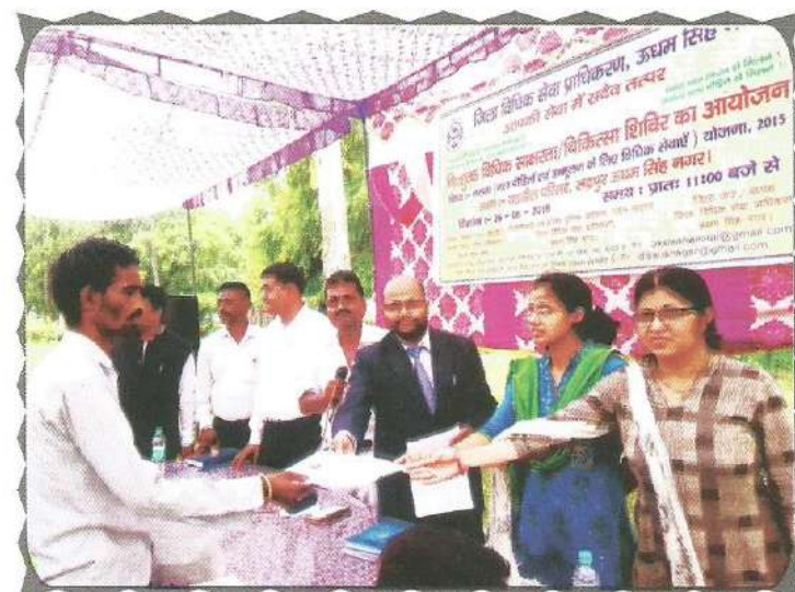
Awareness Camp on Drug Abuse in Distt. U.S. Nagar