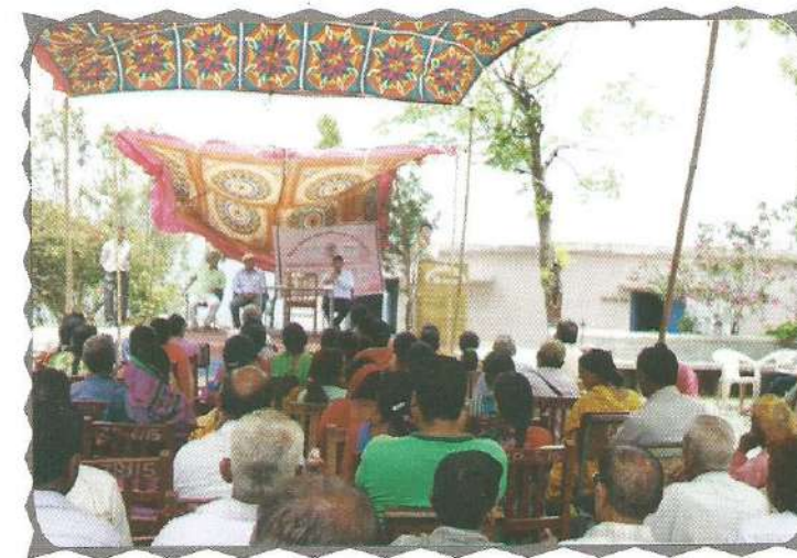
Mega Camp on New Module in District-Pauri