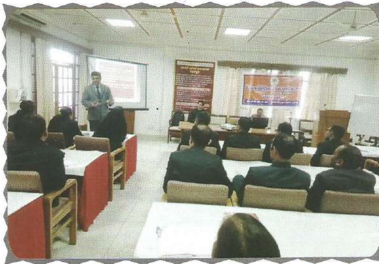
Expert imparting training to Panel Lawyers at Dehradun

To enhance the working skills and for ensuring accountability of panel lawyers towards the works assigned to them, the Uttarakhand State Legal Services Authority had conducted training programmes as per the second training module approved by NALSA in eight phases for the districts