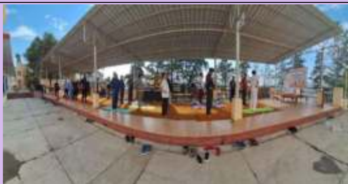
UDHAM SINGH NAGAR