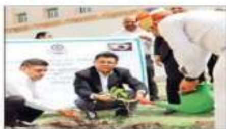
यौध्यादीषण कालो न्यायाधिकारी च अन्य ।