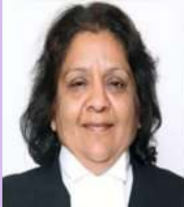
Hon'ble Ms. Justice Ritu Bahri Hon'ble Patron-in-Chief, UKSLA, Nainital