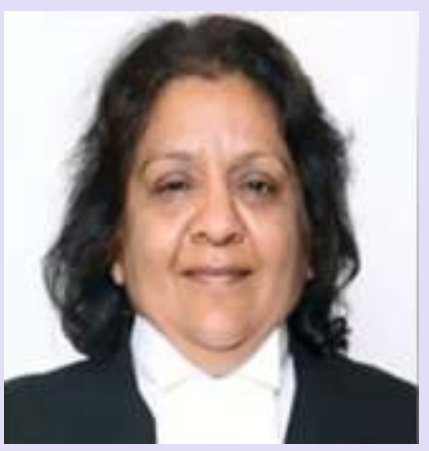
Hon'ble Ms. Justice Ritu Bahri Hon'ble Patron-in-Chief, UKSLSA, Nainital