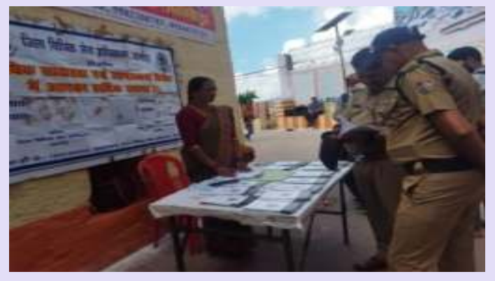
Door-to-door survey was conducted