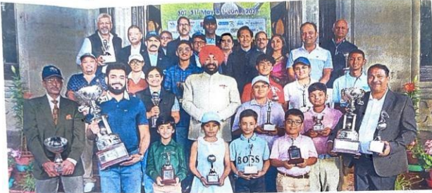
नैनीताल के राजभवन में गोल्फ प्रतियोगिता के विजेताओं के साथ राज्यपाल लेफ्टिनेंट जनरल (सेनि.) गुरमीत सिंह

रविवार को राजभवन में आयोजित सम्मान समारोह में राज्यपाल ने कहा कि गोल्फ प्रतियोगिता के माध्यम से खिलाड़ियों ने न केवल खेल का आनंद लिया होगा, बल्कि नैनीताल की प्राकृतिक सुंदरता और शांत वातावरण ने भी उन्हें एक अविस्मरणीय अनुभव मिला होगा। राजभवन गोल्फ कोर्स में खेलने का अनुभव सिर्फ एक खेल नहीं, बल्कि उत्तराखंड की सांस्कृतिक, प्राकृतिक और अतिथि परंपरा से जुड़ने का अवसर भी है। उन्होंने विश्वास जताया कि देश के विभिन्न भागों से आए गोल्फ खिलाड़ी और उनके स्वजन प्रदेश की इस सुंदरता व मेहमान नवाजी का संदेश अपने साथ लेकर जाएंगे। कहा कि विगत वर्षों में राजभवन गोल्फ कोर्स को आमजन, विशेषकर स्कूलों बच्चों के लिए भी खोला गया है, ताकि युवाओं में गोल्फ के प्रति रूचि उत्पन्न हो सके। गोल्फ