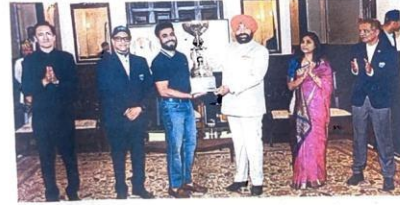
नैनीताल के राजभवन में गोल्फ प्रतियोगिता विजेताओं को ट्रॉफी प्रदान करते राज्यपाल लेफ्टिनेंट जनरल (सेनि.) गुरमीत सिंह •

को लोकप्रिय और इससे आमजन को जोड़ने का प्रयास किया जा रहा है। उन्होंने महिला खिलाड़ियों और युवाओं की भागीदारी पर प्रसन्नता व्यक्त करते हुए प्रतियोगिता को और बेहतर बनाने के निरंतर