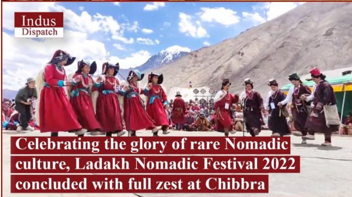
Celebrating the glory of rare Nomadic culture, Ladakh Nomadic Festival 2022 concluded with full zest at Chibbra