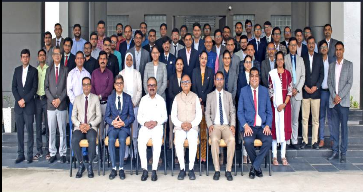
(ECT-03-2025) Master Trainer Programme for New Master Trainers & (ECT-11-2025) Programme for Technical Staffs of District Courts / District System Administrator / System Officer at Gujarat State Judicial Academy from 21.07.2025 to 22.07.2025

On July 21 & 22, 2025, the Gujarat State Judicial Academy held a two training programme for batch 2 i.e. (ECT_11_2025) for 18 technical staff, including District System Administrators and System Officers, from the District Courts and discussed about the hardware and