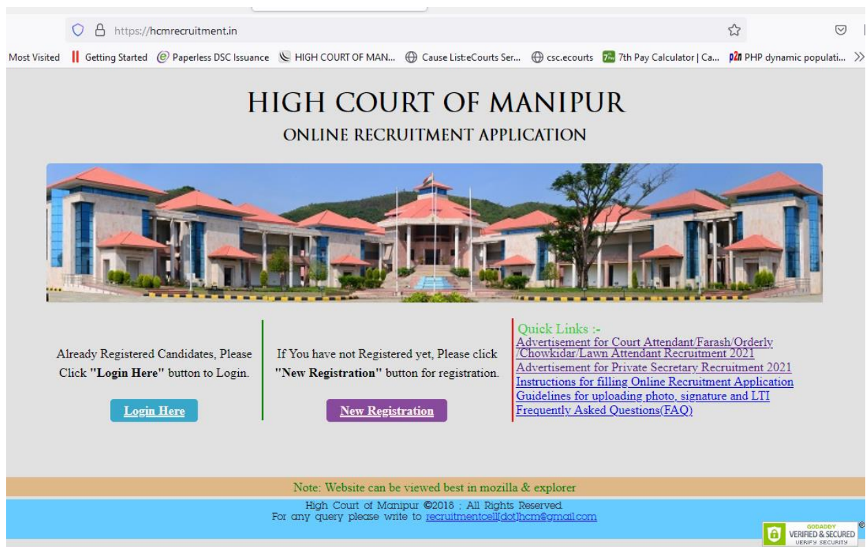
Figure: Home Page

Recruitment for Lower Division Assistant (LDA), Judicial Officers Grade I & Grade III, Drivers, Private Secretary, Court Attendant/ Farash/ Orderly/ Chowkidar/ Lawn Attendant and Cook etc. have been done through this portal.