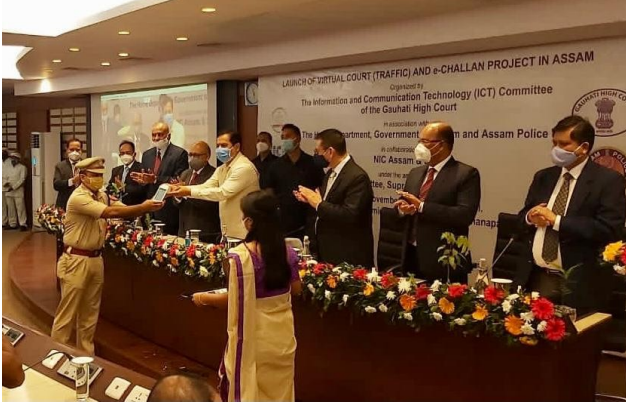
Inauguration of Virtual Court and e-Challan by Hon'ble Chief Minister of Assam, Sri SarbanandaSonowal

Hon'ble Mr Justice R.C. Chavan, Former Judge, Bombay High Court and Vice Chairperson, e-Committee, Supreme Court of India, Hon'ble Chief Justices and Judges of Hon'ble High Courts, Secretary, Department of Law and Justice,