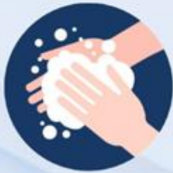
Washing/ sanitising hands