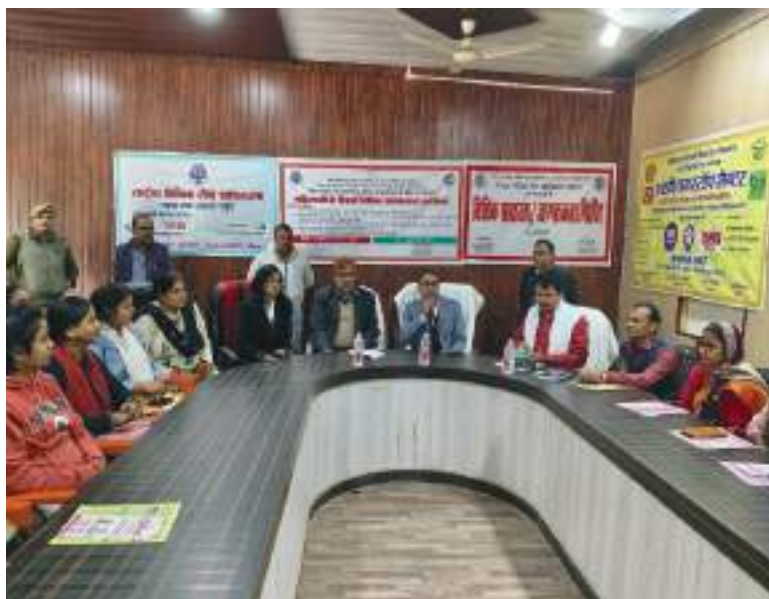
Glimpse from a Legal Awareness Programme Organized under the Initiative Vidhan Se Samadhan

At Community Level : Empowering Communities through Knowledge