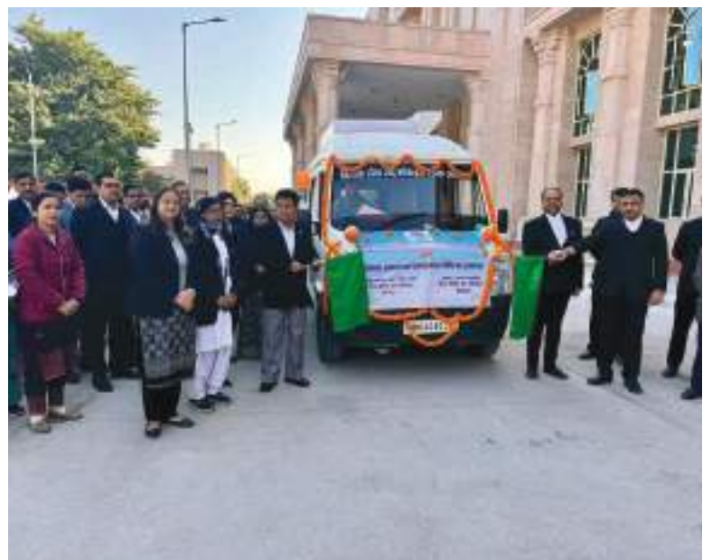
Glimpse from the Flag-Off Ceremony of the Mobile Van for Legal Awareness in Dehradun

December 5 and 6, 2024: In Dehradun (Uttarakhand), a legal aid awareness campaign was conducted through a mobile van in remote, rural, and slum areas, as well as schools and densely populated regions. The initiative aimed to promote accessible justice and raise awareness about legal rights and government schemes. The mobile van was flagged off on December 5 by Ld. District Judge Mr. Prem Singh Khimal, with Judicial Officers, Defense Counsels, Paralegals, and court employees in attendance. The van provided information on legal aid, NALSA schemes, various pensions, government applications, and scholarships, ensuring that legal assistance reached those in need. Awareness camps were held at locations including Rajpur Road, Premnagar, Doiwala, and Rishikesh, where legal experts engaged with the public to clarify doubts and guide them on availing government benefits. This initiative ensured that legal aid information reached vulnerable communities at their doorstep.