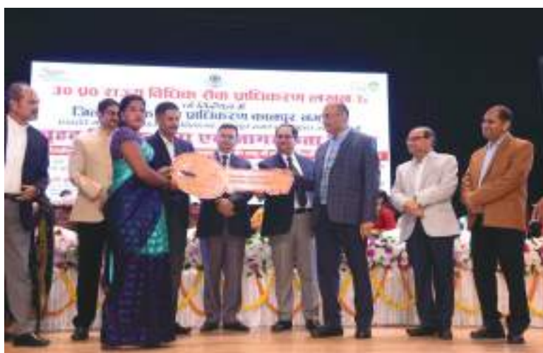
Glimpse From Mega Legal Awareness Camp at CSJM University (Uttar Pradesh)

October & December, 2024: NALSA, in collaboration with the National Commission for Women (NCW), is organizing Legal Awareness Programmes at the Block-level across 11 States, namely, Andhra Pradesh, Goa, Haryana, Himachal Pradesh, Jharkhand, Karnataka, Kerala, Punjab, Tamil Nadu, Tripura, and Uttar Pradesh, under the initiative called "Vidhan Se Samadhan". This initiative is designed to promote legal literacy among women in 1,495 blocks, with the first phase running until March 2025. Under this initiative, 250 camps were organized in these states in October, 2024 followed by 319 camps in December, 2024. The aim of these camps is to empower women by providing them essential knowledge about their legal rights and the legal remedies available under various laws, such as the Bharatiya Nyaya Sanhita, 2023; the Indian Penal Code, 1860; the Protection of Women from Domestic Violence Act, 2005; and the Sexual Harassment of Women at Workplace (Prevention, Prohibition and Redressal) Act, 2013, among others. Under the programme, participants are also educated about the roles and functions of key institutions and functionaries such as NALSA, NCW, Courts, etc.