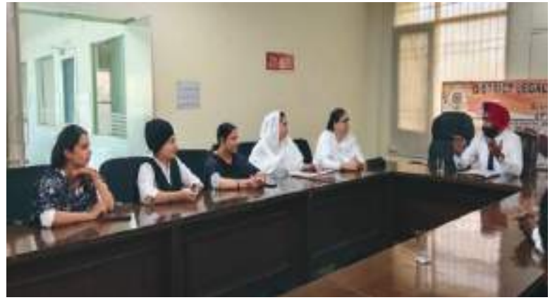
Glimpse From Capacity Building Programme Organized by DLSA, Sirsa (Haryana)

October 21, 2024: DLSA, Sirsa (Haryana) convened a meeting with Panel Advocates and Para-Legal Volunteers (PLVs) to review the implementation of various NALSA schemes and assess their effectiveness. The session focused on addressing challenges faced by the advocates and PLVs during outreach camps in remote areas and identifying ways to enhance service delivery. The meeting served as a platform to gather feedback and ensure better execution of legal aid initiatives, reaffirming DLSA Sirsa's commitment to providing accessible and effective legal support in all regions. It also emphasized the need for capacity building and strategic collaboration to strengthen legal awareness and ensure that justice reaches the most marginalized sections of society.