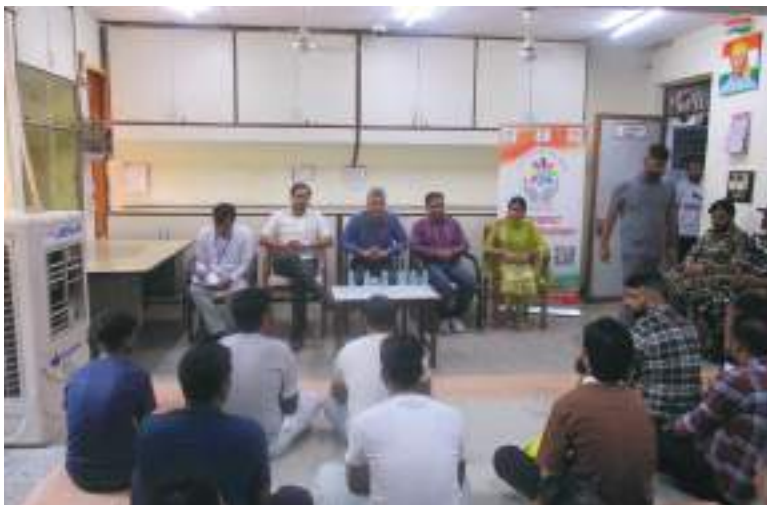
DLSA, North (Delhi) at Rohini Jail