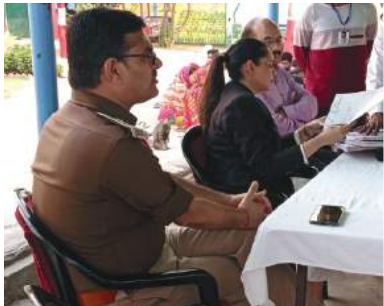
DLSA, Nainital (Uttarkhand) at Sub-Jail, Haldwani.

October 27, 2024: The Legal Aid Defense Counsels (LADCs) of DLSA, Tinsukia (Assam) actively engaged with 125 Undertrial Prisoners (UTPs) in the District Jail, Tinsukia. The focus was on addressing concerns related to trial proceedings, bail applications, and their legal right. The initiative aimed to ensure that undertrial prisoners receive timely legal assistance and are aware of their entitlements under the law. During the visit, the Ld. Secretary, DLSA, Tinsukia, personally interacted with 91 prisoners, discussing their cases, addressing grievances, and guiding them on legal procedures to facilitate fair trials. Additionally, 69 individuals, including family members of UTPs, who visited the DLSA office, were provided legal consultations and assistance by the LADCs on various legal matters, including family disputes, property issues, and procedural guidance. These efforts reflect DLSA's commitment to delivering accessible legal aid.