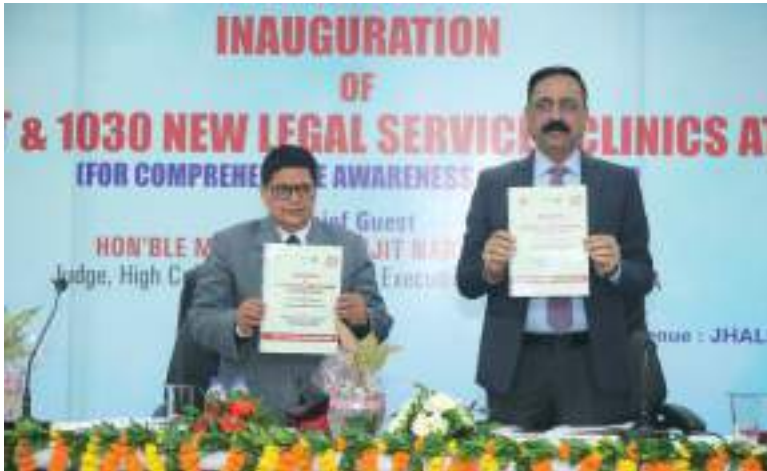
Glimpse from Inauguration of New Legal Services Clinic by Jharkhand SLSA

December 14, 2024: At Nyaya Sadan, Jharkhand SLSA (Ranchi), 1,030 new Legal Services Clinics were inaugurated to expand legal aid access across 25% of Jharkhand's panchayats. Earlier, the state had around 400 clinics. In line with NALSA's directives, Jharkhand SLSA approved the expansion to ensure legal awareness and assistance for the underprivileged, aiming to bridge the gap between legal services and rural communities. DLSAs were tasked to identify panchayats with necessary infrastructure, and PLVs were to be deputed twice a week at each clinic to provide guidance and support. This initiative strengthens grassroots legal aid, ensuring justice reaches the most marginalized while fostering greater legal empowerment at the village level. This expansion bridges the justice gap in rural Jharkhand.