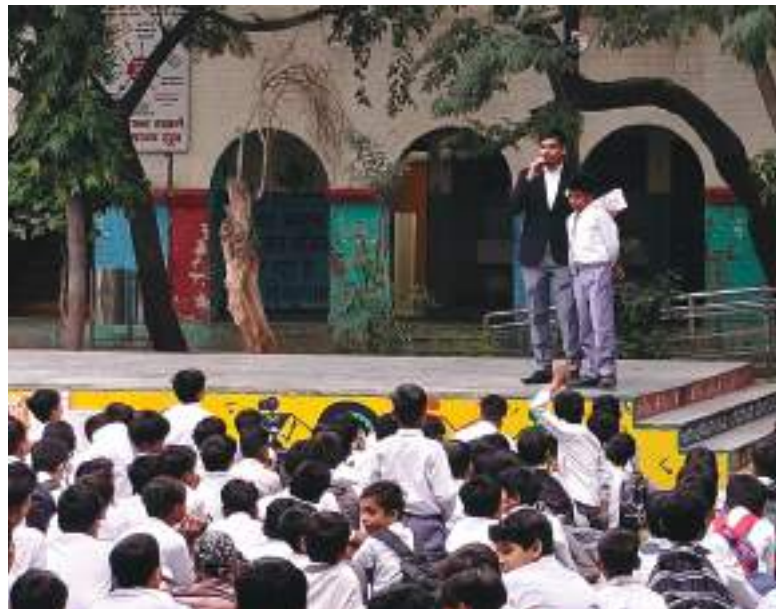
Glimpse from a Programme in Delhi under DLSA - Disseminating Information to Secure Wholesome Awareness among Children.

September 3, 2024: DLSA East, Shahdara, and North-East (Delhi), in collaboration with the Directorate of Education, Government of NCT, Delhi, launched DISHA – Disseminating Information to Secure Wholesome Awareness among Children: सजग एवं सुरक्षित बचपन की ओर. This initiative seeks to educate school communities on topics such as Virtual Touch, Cyber Safety and Consciousness, Rights of Children concerning child marriage and child labour, reporting mechanisms, and menstrual hygiene. In October 2024 alone, 209 awareness programmes were conducted across 46 schools, impacting approximately 45,700 students, teachers, principals, and school staff. This large-scale effort highlights the commitment of legal services authorities to fostering a secure, informed, and empowered environment for children. Furthermore, it encourages open discussions among students, ensuring they are well-equipped to recognize and respond to challenges affecting their safety and well-being. Such initiatives foster a culture of awareness and prevention in schools.