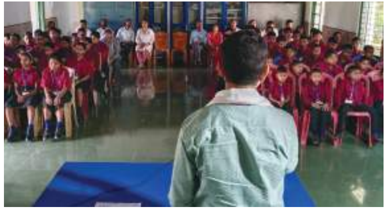
DLSA, Dibrugarh (Assam) at Moran Blind School Dibrugarh

October 21, 2024: DLSA, Dibrugarh (Assam) organized an awareness programme at Moran Blind School, Dibrugarh, focusing on the Rights of Persons with Disabilities Act, 2016. Led by the Secretary, DLSA, the event aimed to educate students about their legal rights and entitlements under the Act. The programme also covered key aspects of the Prohibition of Child Marriage Act, 2006, highlighting its role in safeguarding children's rights and preventing early marriages. A total of 70 students participated, engaging actively in discussions and gaining valuable insights. This initiative underscores DLSA's commitment to promoting legal awareness, ensuring inclusivity, and empowering marginalized communities.