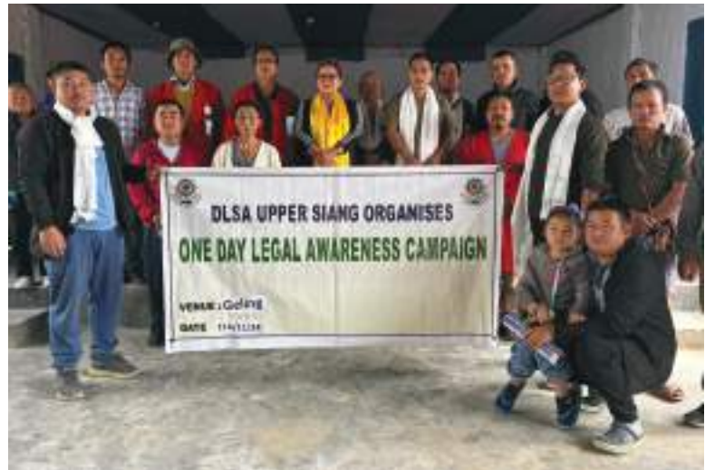
DLSA, Upper Siang (Arunachal Pradesh) at Gelling Village

November 16, 2024: DLSA, Upper Siang (Arunachal Pradesh) conducted the 2nd Day Legal Awareness Programme at Gelling, the last village of India. The Warfoot Warriors of DLSA Upper Siang organized the session in an area where both Indian and Chinese armies conduct patrols, highlighting the geographical and strategic significance of the region. Emphasizing their motto, "Reaching the Extreme," the team undertook a barefoot march covering nearly 5 km to symbolize their commitment to bringing legal services to even the most isolated communities. The awareness session addressed critical topics such as fundamental rights, government welfare schemes, land rights, and legal aid services. This initiative bridged the legal accessibility gap, demonstrating that distance should not be barriers to legal empowerment.