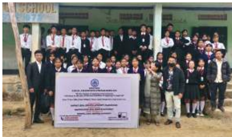
DLSA, Tamenglong (Manipur) at Model Village High School

November 8, 2024: DLSA, South-West (Delhi) conducted an Awareness Session at MCD Primary Boys School, Bijwasan, attended by 100 students. The session covered two critical topics: Waste Management & Pollution and Good Touch & Bad Touch, along with an overview of the POCSO Act, 2012. Students learned about waste segregation, recycling, and practices to reduce pollution for a cleaner environment. The session also emphasized personal safety, educating students about bodily autonomy, recognizing inappropriate behavior, and how to report such incidents. A detailed explanation of the POCSO Act, 2012, was provided to help protect children from sexual abuse. The interactive format encouraged students to share their concerns and ask questions, fostering a safe space for discussions. This initiative aimed to empower students with essential knowledge for both environmental responsibility and personal safety, ensuring they grow into informed and responsible citizens.