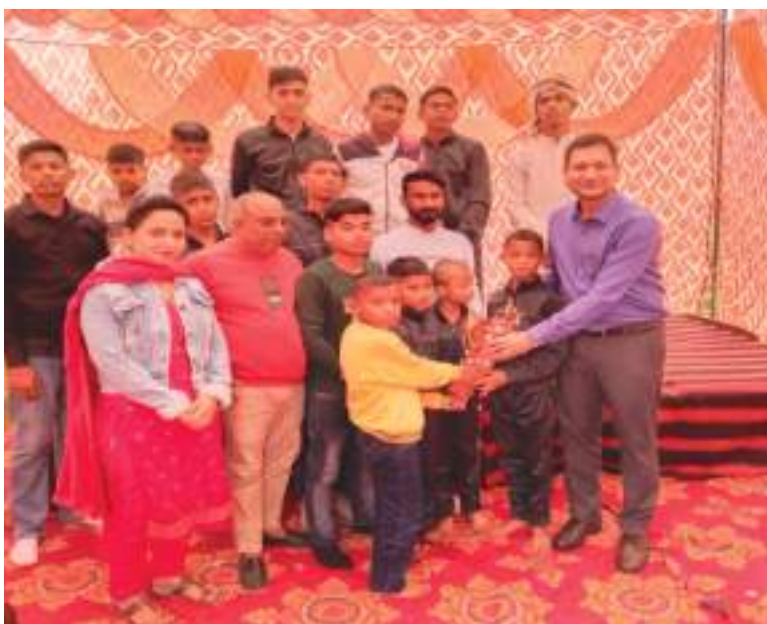
Glimpse from Legal Awareness Programme Organized by DLSA, Kurukshetra (Haryana)

November 7, 2024: Tamenglong (Manipur) DC Legal Aid Clinic, in collaboration with Model Village High School, organized a Legal Awareness Programme titled 'Child Rights' in Manipur, focusing on educating young minds about their legal protections and entitlements. The event was led by the Ld. Secretary, DLSA Tamenglong. The programme aimed to raise awareness about the NALSA (Child-Friendly Legal Services for Children) Scheme 2024, ensuring that students understood their rights related to education, juvenile justice, and free legal aid. A total of 50 students participated, engaging in interactive discussions and real-life case studies. This initiative enhanced their understanding of the legal services available to them, empowering them to seek justice and assistance when needed.