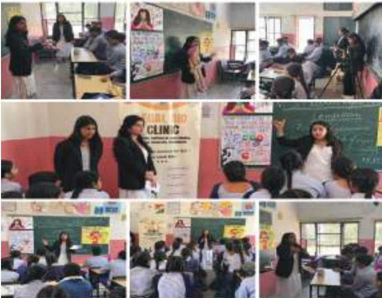
DLSA, Chandigarh at Government Model Senior Secondary School, Maloya (Chandigarh)