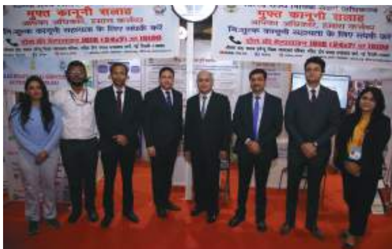
Delhi SLSA at India International Trade Fair, 2024.