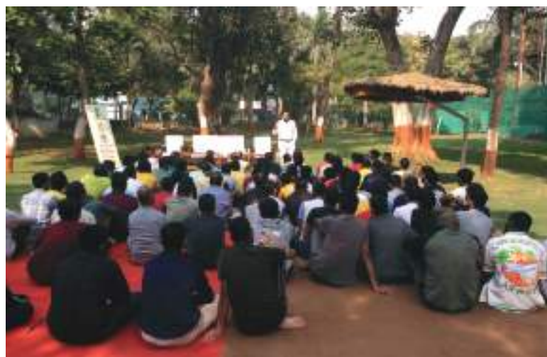
DLSA, New Delhi at Tihar Jail

November 23, 2024: DLSA, New Delhi organized a Legal Awareness Session at Jail No. 04, Tihar Jail, Delhi, focusing on “Benefits of Lok Adalat, Compounding and Plea Bargaining, and the Probation of Offenders Act, 1958.” The Ld. Secretary, New Delhi, DLSA, also visited Jail No. 04, engaging with Under Trial Prisoners (UTPs) and assessing the jail’s working conditions to ensure better legal aid accessibility. During the session, he informed UTPs about free legal aid services, including daily visits by legal aid counsel and clinics at the jail. He further met with the jail’s Superintendent/Deputy Superintendent to ensure the efficient processing of UTPs’ applications and facilitate seamless interaction with visiting advocates, reinforcing the commitment to safeguarding prisoners’ legal rights and expediting justice.