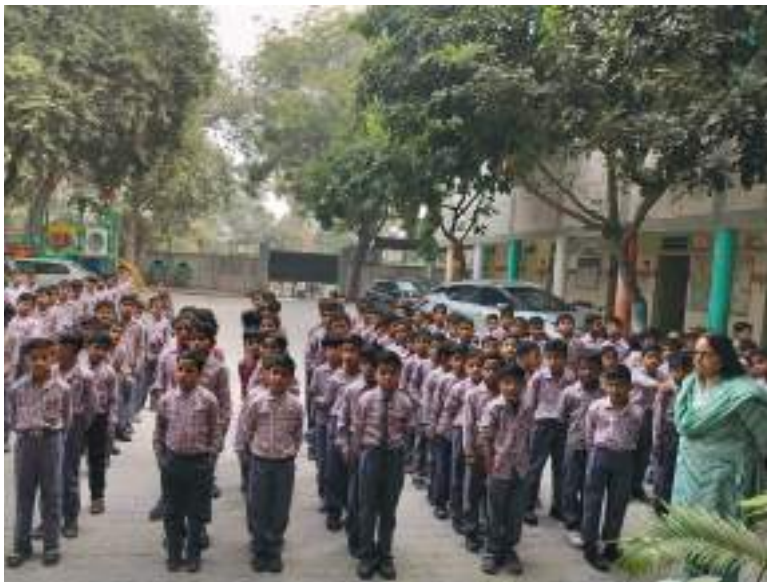
DLSA, South-West (Delhi) at MCD Primary Boys School

November 7, 2024: Tamenglong (Manipur) DC Legal Aid Clinic, in collaboration with Model Village High School, organized a Legal Awareness Programme titled 'Child Rights' in Manipur, focusing on educating young minds about their legal protections and entitlements. The event was led by the Ld. Secretary, DLSA Tamenglong. The programme aimed to raise awareness about the NALSA (Child-Friendly Legal Services for Children) Scheme 2024, ensuring that students understood their rights related to education, juvenile justice, and free legal aid. A total of 50 students participated, engaging in interactive discussions and real-life case studies. This initiative enhanced their understanding of the legal services available to them, empowering them to seek justice and assistance when needed.