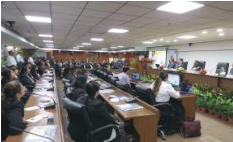
Glimpse From Three - Day Induction Training Programme Organized by Delhi SLSA

October 7 to 9, 2024: Delhi SLSA organized a three-day Induction Training Programme for newly empanelled Legal Services Advocates (LSAs) of South, South East, North East, and Central DLSAs, along with LADCs from South and South East Districts. The training was held at the Seminar Hall, Saket Courts Complex, New Delhi. Sessions covered diverse topics, including the Legal Services Authorities Act, 1987, Victim Compensation Scheme, POCSO Act, evidence handling, family law, bail provisions, and professional ethics. Experienced resource persons provided valuable insights through case studies and interactive discussions, equipping the participants with essential skills to ensure effective legal aid delivery. The programme reinforced the commitment to accessible and quality legal assistance, emphasizing the role of LSAs in safeguarding justice for marginalized communities.