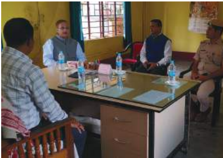
DLSA, Tinsukia (Assam) at District Jail, Tinsukia.

October 17 and 26, 2024: DLSA, Nainital (Uttarakhand) conducted legal awareness camps at Sub-Jail Haldwani, aimed at addressing prisoner's concerns and educating them about their legal rights and entitlements. The sessions covered topics, including the National Lok Adalat, compounding of offences, remission, and digital services such as the e-Prison Portal and e-True Copy, which facilitate access to legal documents and case information. Prisoners were also informed about welfare schemes, such as the Support to Poor Prisoners Scheme, which provides financial aid for legal representation, and the benefits of skill development and vocational training programmes designed to aid their rehabilitation and reintegration into society post-release. Additionally, Para-Legal Volunteers (PLVs) at jail were sensitized about the NALSA Prison Legal Aid Clinic Standard Operating Procedure (SOP) to enhance their capacity in providing Legal assistance within the prison system. The initiative underscores DLSA's commitment to strengthening prison legal aid mechanisms.