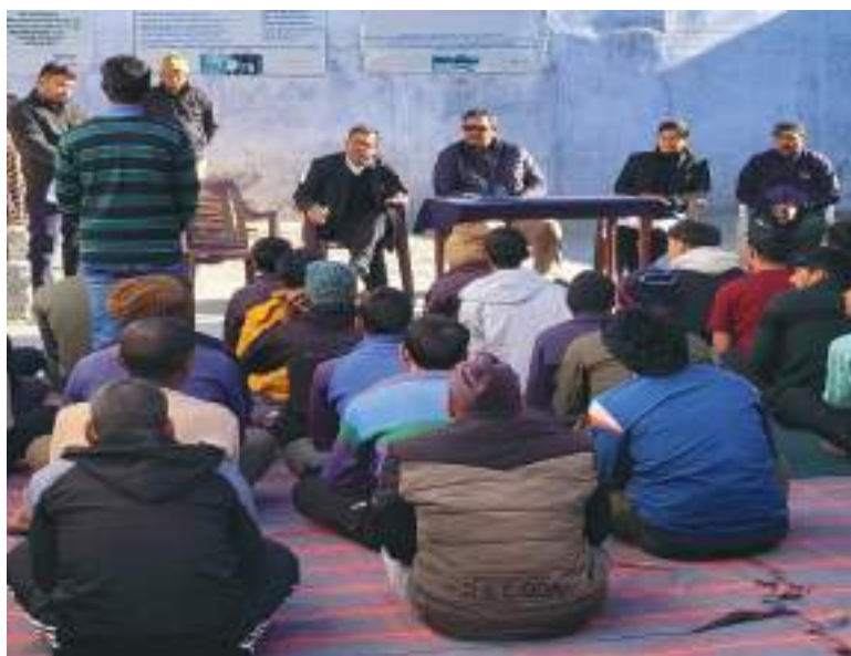
DLSA, Champawat (Uttarakhand) at Jail Inspection, Lohaghat

December 19, 2024: DLSA Champawat (Uttarakhand) conducted an inspection at Judicial Badighrah Lohaghat as part of the Special Campaign for Old & Terminally Ill Prisoners (10th Dec 2024 – 10th Mar 2025). The visit aimed to assess the living conditions, legal needs, and healthcare requirements of inmates, ensuring that vulnerable prisoners receive the necessary support. The committee interacted with 35 inmates, informing them about their legal rights, NALSA welfare schemes, and available legal aid services. The team provided detailed guidance on the process of applying for legal aid and assistance, ensuring that inmates understood how to seek legal representation, bail remedies, and medical parole. The initiative specifically focused on elderly and ailing prisoners, recognizing their increased need for legal and healthcare support. By addressing these concerns, DLSA Champawat reinforced its commitment to justice, prisoner welfare, and access to legal aid.