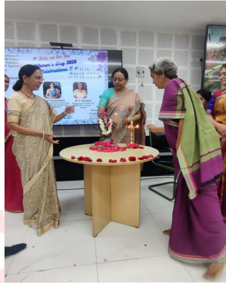
(Lighting of the ceremonial lamp by the dignitaries)