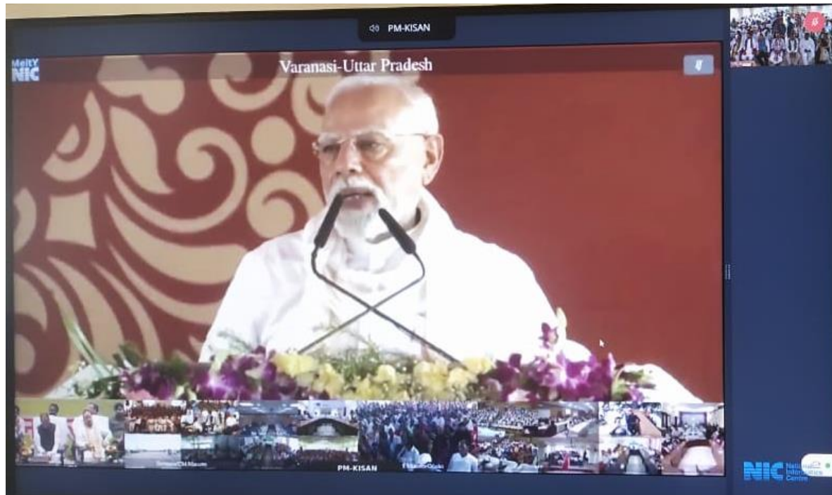
Hon'ble Prime Minister addressing the beneficiaries and participants from Varanasi, Uttar Pradesh