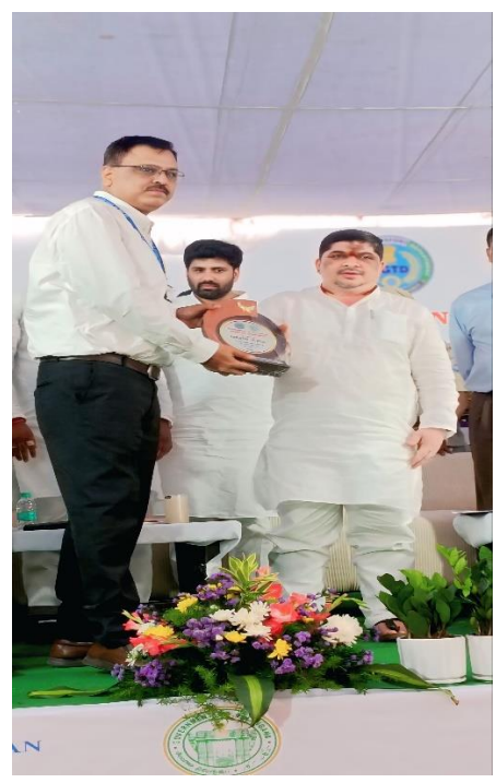
SIO Telangana Felicitated by Hon'ble Minister for Transport and BC Welfare