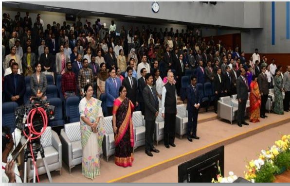
Judicial Fraternity along with NIC team in the audience