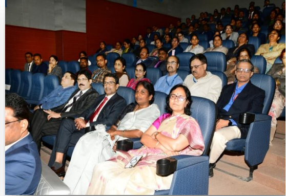
NIC Officials at the event