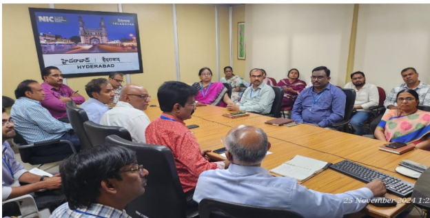
State Coordinator in meeting HoDs and officers of NIU Hyderabad