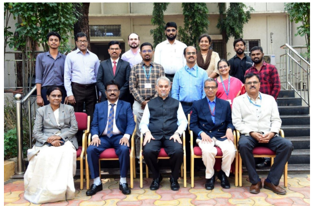
State Coordinator along with Hon'ble Judges of eCommittee and NIC officers.