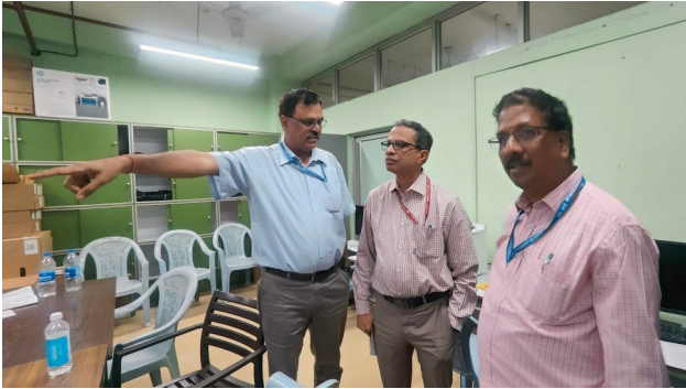
State Coordinator along with SIO at Dharani Project lab on the 8 th floor