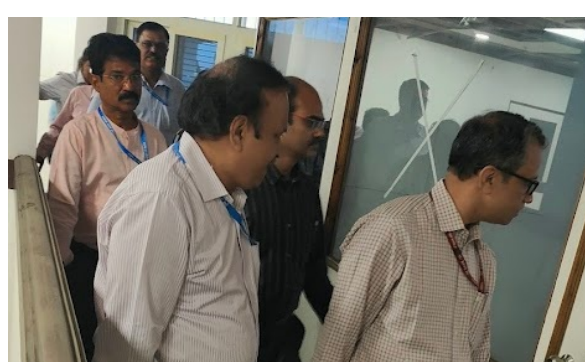
State Coordinator along with SIO & ASIO(state) reviewing the 4 th Floor renovation