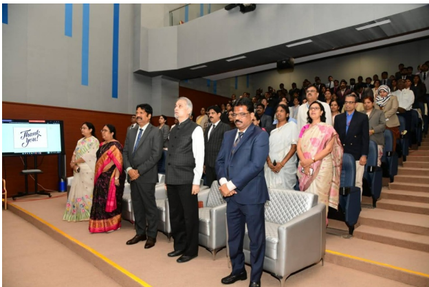
State Coordinator attending the launch of AI tools-Shruthi, Saransh & Panini-developed by NIC along with NIC officials