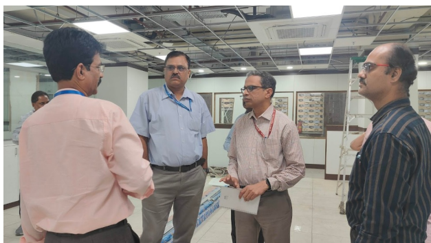
State Coordinator along with SIO & ASIO(state) reviewing the 4 th Floor renovation