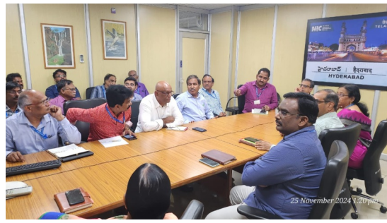
State Coordinator in meeting HoDs and officers of NIU Hyderabad