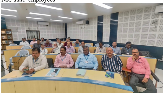
NIC State Centre/DIO/NIU/Central Projects officers.