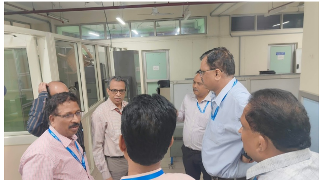
State Coordinator along with SIO reviewing proposed renovation of the 8 th floor where regional SoC is to be located.