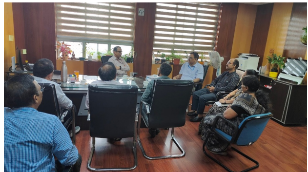
State Coordinator in meeting with SIOs/ASIOs/Head NIU/NICSI / Central projects /HoDs etc.