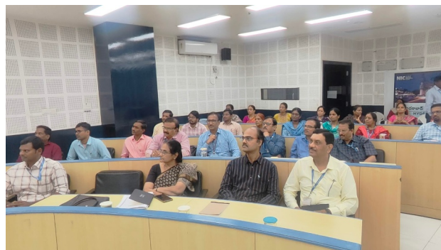
NIC State Centre/ DIOs//NIU/Central Projects officers.