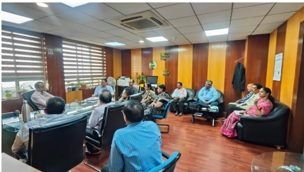
State Coordinator in meeting with SIOs/ASIOs/Head NIU/NICSI / Central projects /HoDs etc.