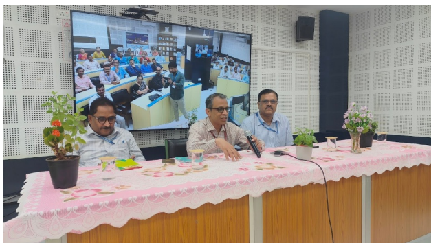
State Coordinator along with Head NIU and SIO addressing NIC state employees

State coordinator emphasised on the various initiatives specifically w.r.to cyber security , email and large projects including manpower scenarios .