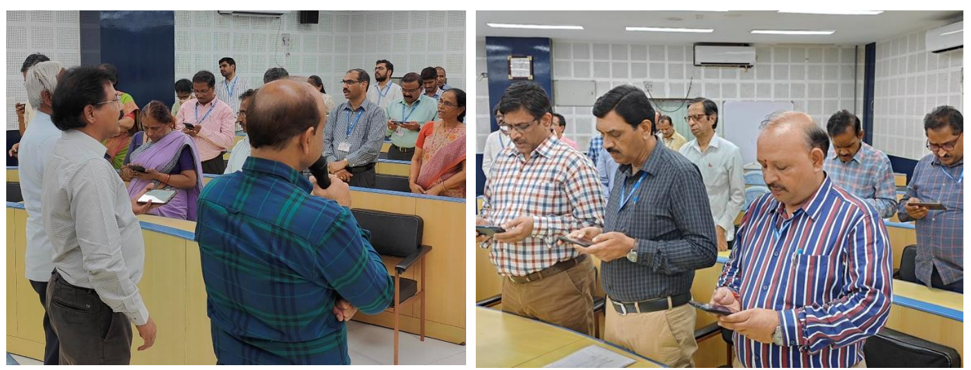
Swachhta Pakhwada Pledge : Officers and Staff of NIC Telangana

Swachhta Pakhwada message ePosters were displayed on LED Notice Boards at the reception/lifts of BRKR Bhavan, NIC Telangana under the supervision of Shri P S Sarma, STD & HoD. These ePosters provided valuable information while one waits for lift (e.g. showing the havoc created by single use plastics and improper waste management)