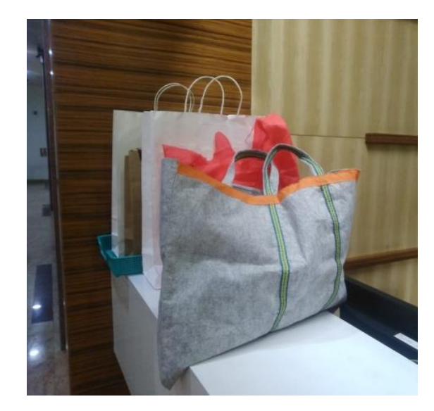
Reusable bags kept at reception