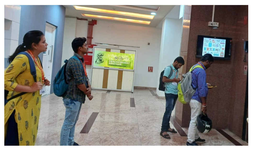
ePosters on the ground floor LED TV

Swachhta Pakhwada message ePosters were displayed on LED Notice Boards at the reception/lifts of BRKR Bhavan, NIC Telangana under the supervision of Shri P S Sarma, STD & HoD. These ePosters provided valuable information while one waits for lift (e.g. showing the havoc created by single use plastics and improper waste management)