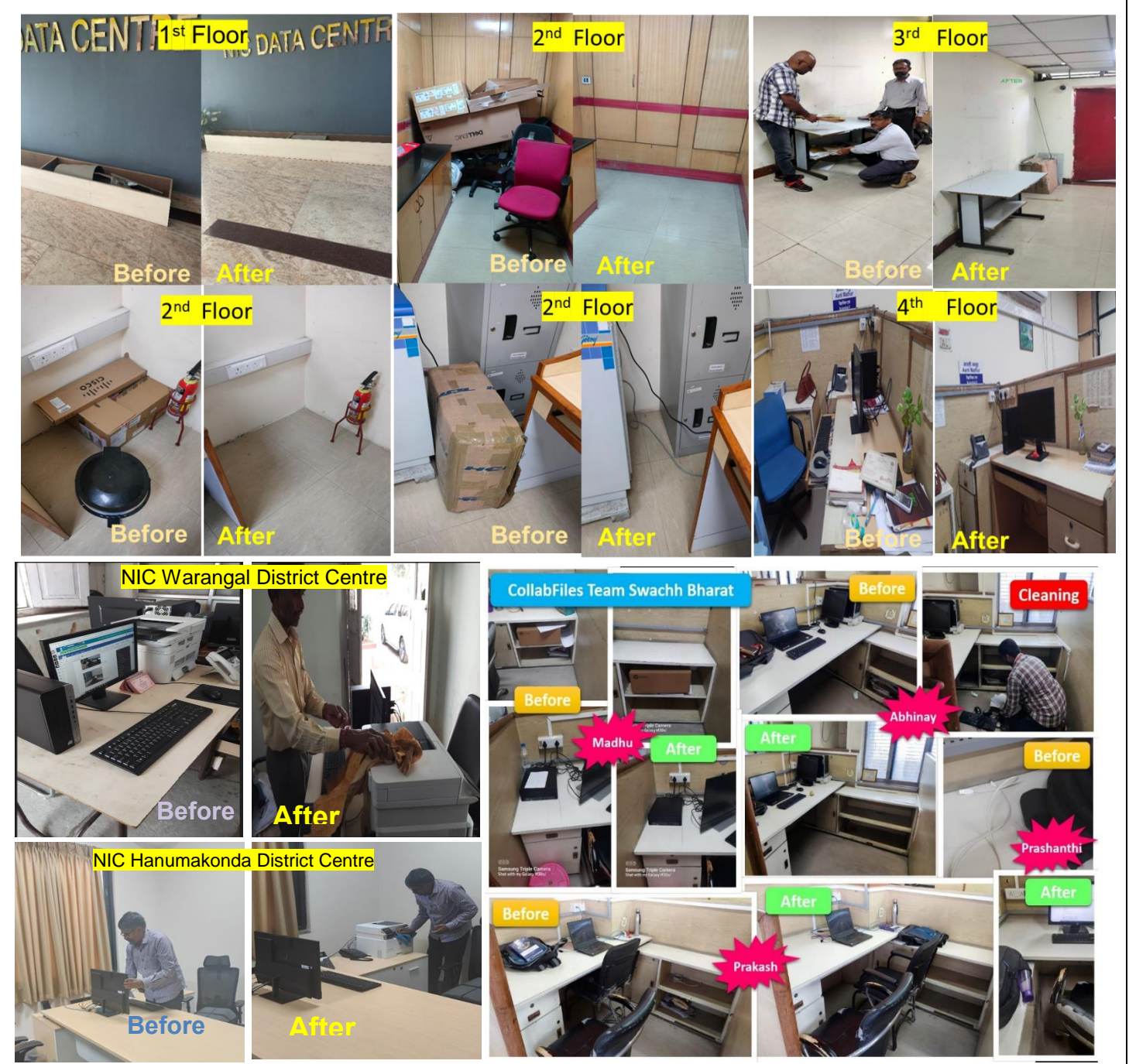
Before and after photographs of cleaning