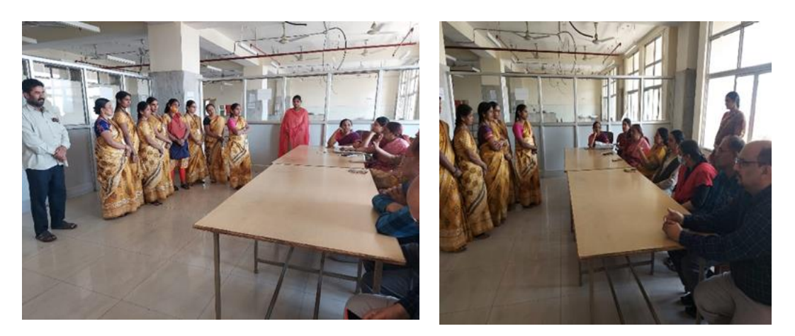
Waste Management Training to House keeping and Canteen staff

As part of Swachhta Pakhwada a waste management session was conducted for the housekeeping and canteen staff. This is very essential as the actual waste management is handled at housekeeping stage. More than 10 NIC staff and 10 housekeeping staff participated in the session . The eagerness to spread awareness on Swachch Bharat by Waste segregation, composting, refusing plastic packaging both in the office and at homes were explained.