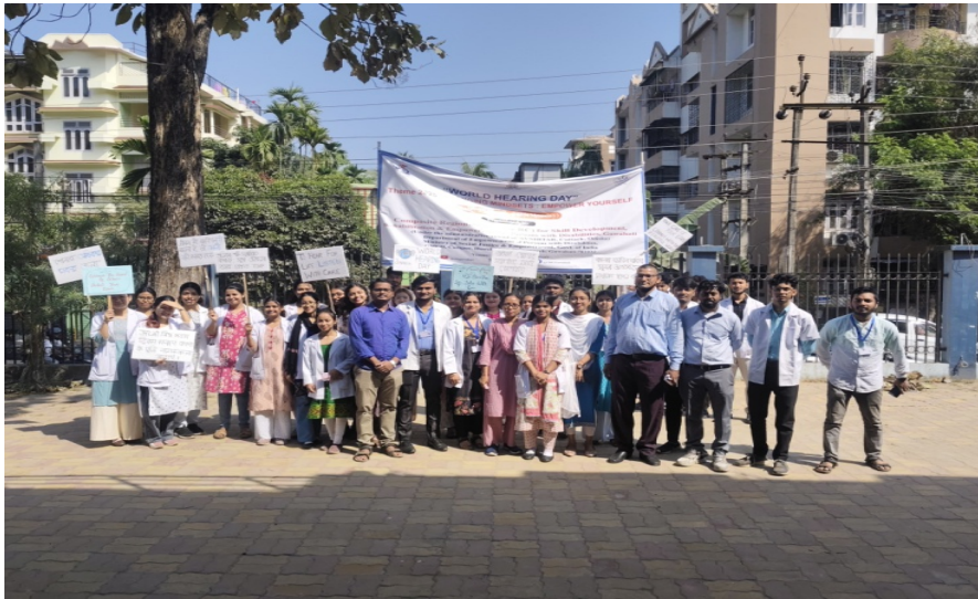
(2) Poster Display & Presentationon & Awarded the Winner on World Hearing Day at Auditorium,CRC- Guwahati (03/03/2025):