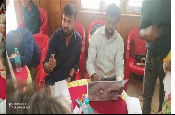
Professionals engaged in P&O Section