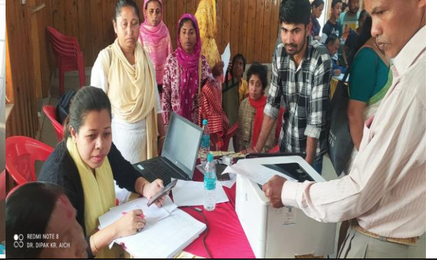
Professional engaged in Psychological Assessment and counseling