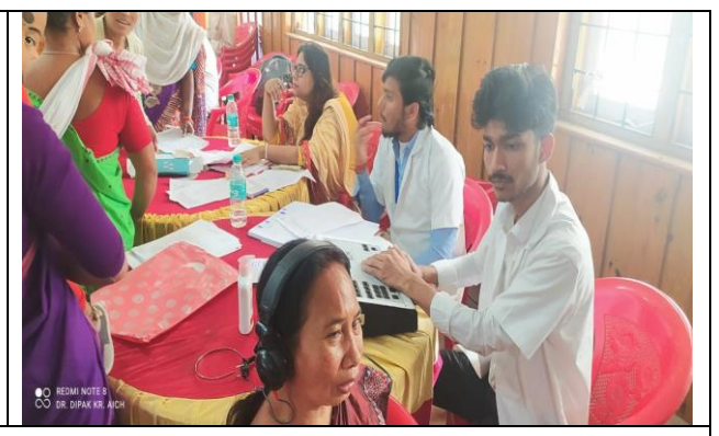
Professional engaged in Speech and Hearing assessment