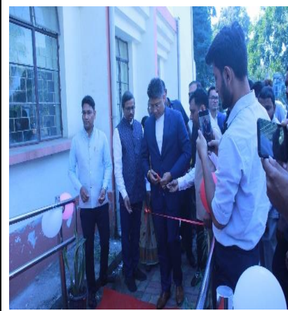
Hon'ble Minister for SJ & E, Govt. of Assam, cutting the ribbon

Speaking on the occasion, Shri. Pijush Hazarika, Hon'ble Minister, Social Justice & Empowerment, Govt. of Assam, stressed upon the need to create a society which gives equal opportunity to empower persons with disabilities. He said that the government is vigorously working on proposals to enhance accessibility in public and private establishments and 4% of jobs reservation for the persons with disabilities.