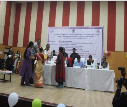
Facilitated to Hon'ble Chairperson for ABCC Govt. of Assam by, CRCSRE, Ghy