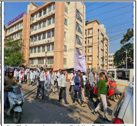
Staff & students on Public Rally on the occasion of IDPD