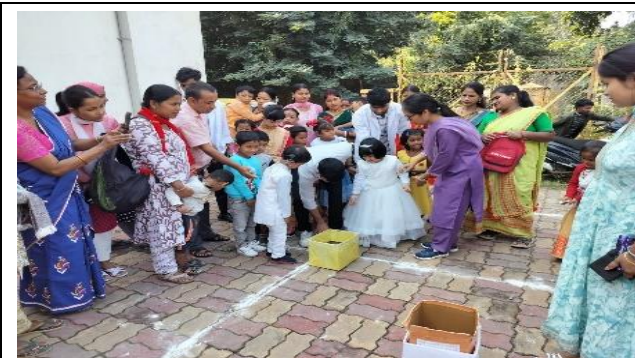
CWSN participated in games and sport activities on the occasion of IDPD