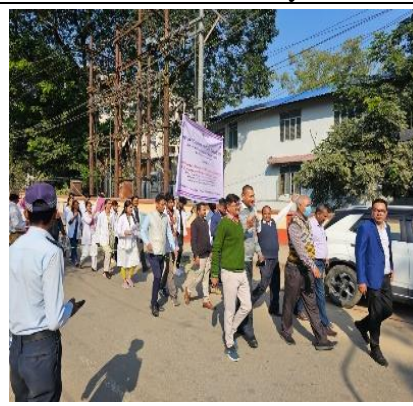
Staff & students on Public Rally on the occasion of IDPD