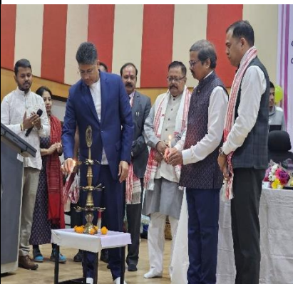
Ceremonial Lamp Lighting by Dignitaries