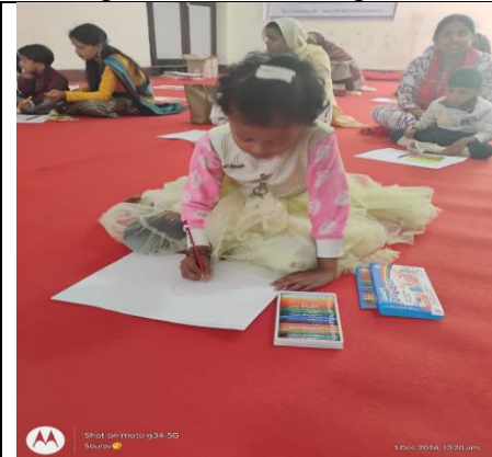
CWSN Participated in painting activities, on the occasion of IDPD