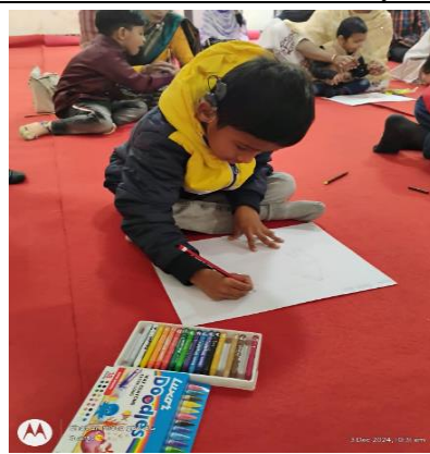
CWSN Participated in painting activities, on the occasion of IDPD