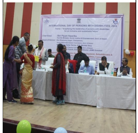
Facilitated to Hon'ble Chairperson, ABCC, Govt. of Assam