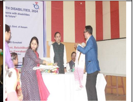
Facilitated to Hon'ble Vice-Chairperson for ABCC Govt. of Assam by, CRCSRE, Ghy