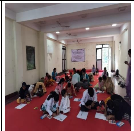
CWSN Participated in painting activities, on the occasion of IDPD