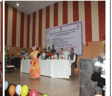
Welcome dance performed by BASLP student on the occasion of IDPD