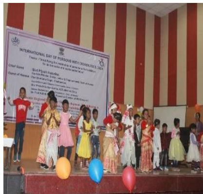
Group dance performed by CWSN on the occasion of IDPD