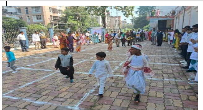
CWSN participated in games and sport activities, on the occasion of IDPD