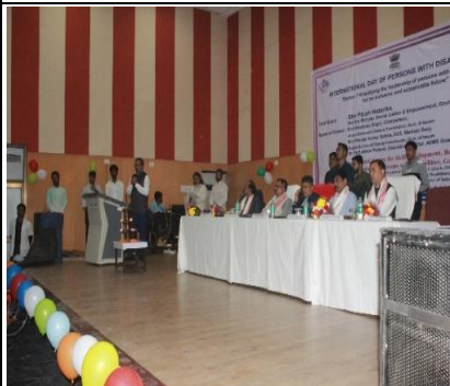
Welcome & Keynote Address by Director, CRCSRE, Ghy