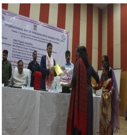
Facilitated to Hon'ble Minister, SJ&E, Govt. of Assam