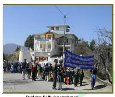
Students Rally for awareness generation regarding TSC