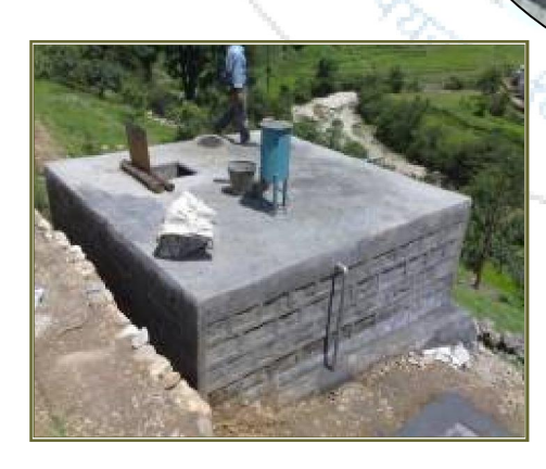
CWR & chlorinator of a W/S scheme