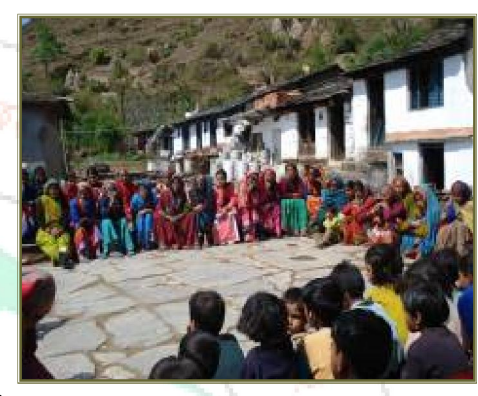
ATD meeting UWSSC-Bamansari GP-kherda