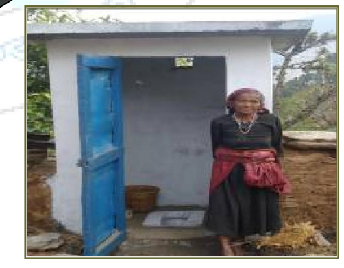
IHHSL toilet constructed in GP- Kharani of Betalghat Block