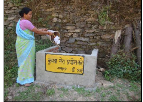
Usage of Garbage pit GP Loshgyani, Block- Ramnagar, Nainital