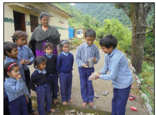
Primary School Narkota, Block Augustmuni, Rudraprayag