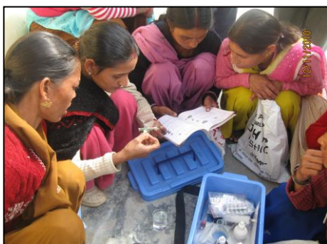
Water Quality FTK- awareness District Nainital