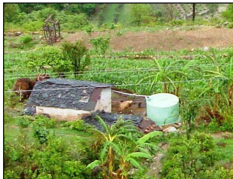
Vill- Nanwakheda, GP Lakhwad, Block Kalsi, Dehradun