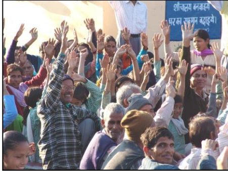
Agree-to-do meeting at Gauhri Mafi, Block-Doiwala,