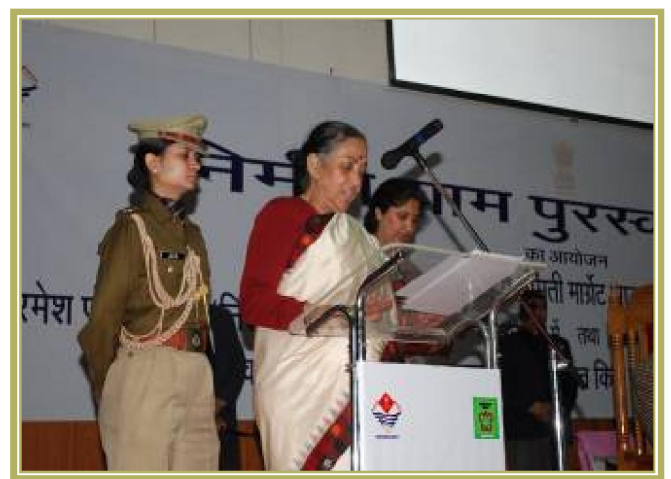
H.E., Governor addressing NGP Awardees