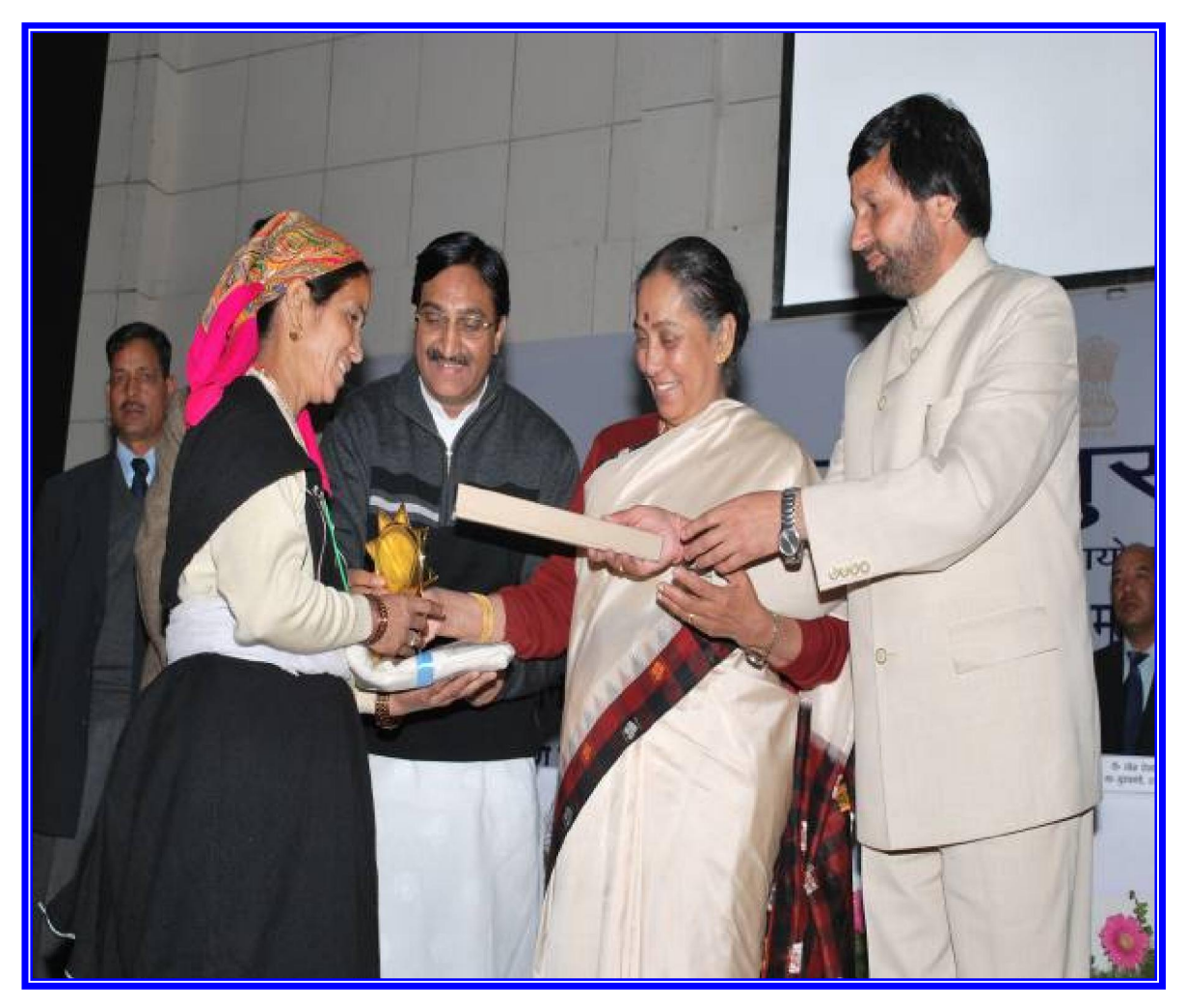
H.E., Governor of Uttarakhand, Hon'ble Chief Minister & Hon'ble Minister, Drinking Water Presenting Nirmal Gram Puraskar Award, 2009

(FROM 1<sup>st</sup> APRIL 2009 TO 31<sup>st</sup> MARCH, 2010)