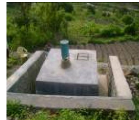
CWR Constructed, at Nainital