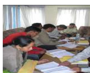
I PQA Sign