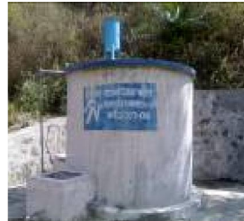
CWR Constructed at Badeth, Dehradun