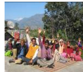
Agree to do Meeting