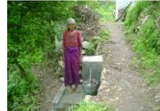
Drinking Water Supply in Stand Post