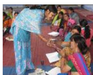
Water Quality Sample Testing