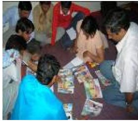
SARAR Tools Demonstration