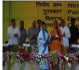
NGP Award Ceremony 2007-08