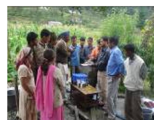
Water Testing by FTK