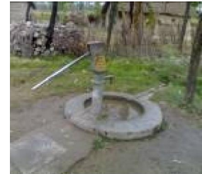
H.P. install at Jeewanwala, Dehradun