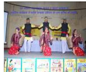
IEC Activities, Champawat