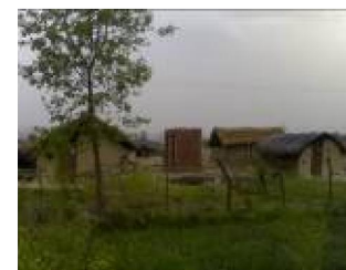
Individual Household Latrines Construction