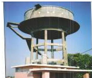
OHT Constructed at Haridwar