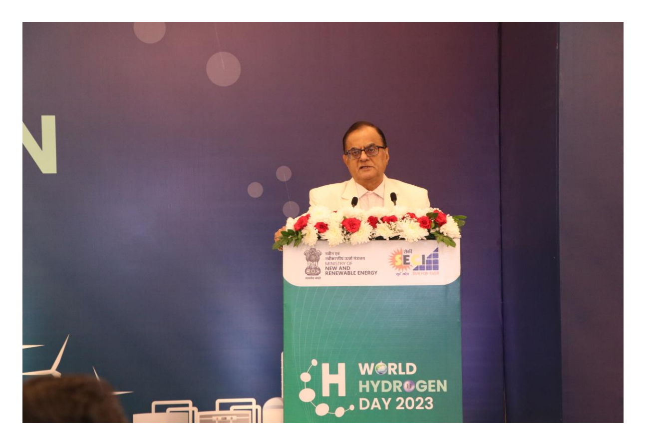
The PSA underscored the need for augmenting domestic capacity for production of electrolyzers in a very short time scale. He said that this is one goal the SIGHT programme addresses.

Prof. Sood emphasized the immediate need for coming out with standards for Type IV cylinders for storing hydrogen. "Our standards are for Type III cylinders. Around the world, it is Type IV cylinders. So India has to come out with standards for Type IV cylinders; with these cylinders, we can triple mileage and filling time is also one tenth or so."