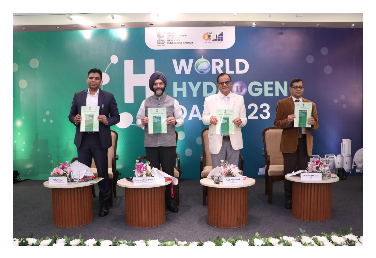
"Let us reiterate our commitment to research, development and deployment of hydrogen solutions"

The Union Minister for New and Renewable Energy, Shri R. K. Singh, conveyed through a video message, that World Hydrogen and Cell Day is a day when we celebrate a transformative element in the universe which holds the promise for a brighter and more sustainable future. "Hydrogen is the most abundant element and it has the potential to revolutionize our energy landscape, mitigate climate change, and power our economies with clean energy. On this World Hydrogen Day, let us reiterate our commitment to research, development and deployment of hydrogen solutions. Let us inspire our industries and communities to embrace hydrogen as a key player in the energy transition. Together, we can ensure that hydrogen becomes a cornerstone of a sustainable and prosperous future for our Planet Earth."