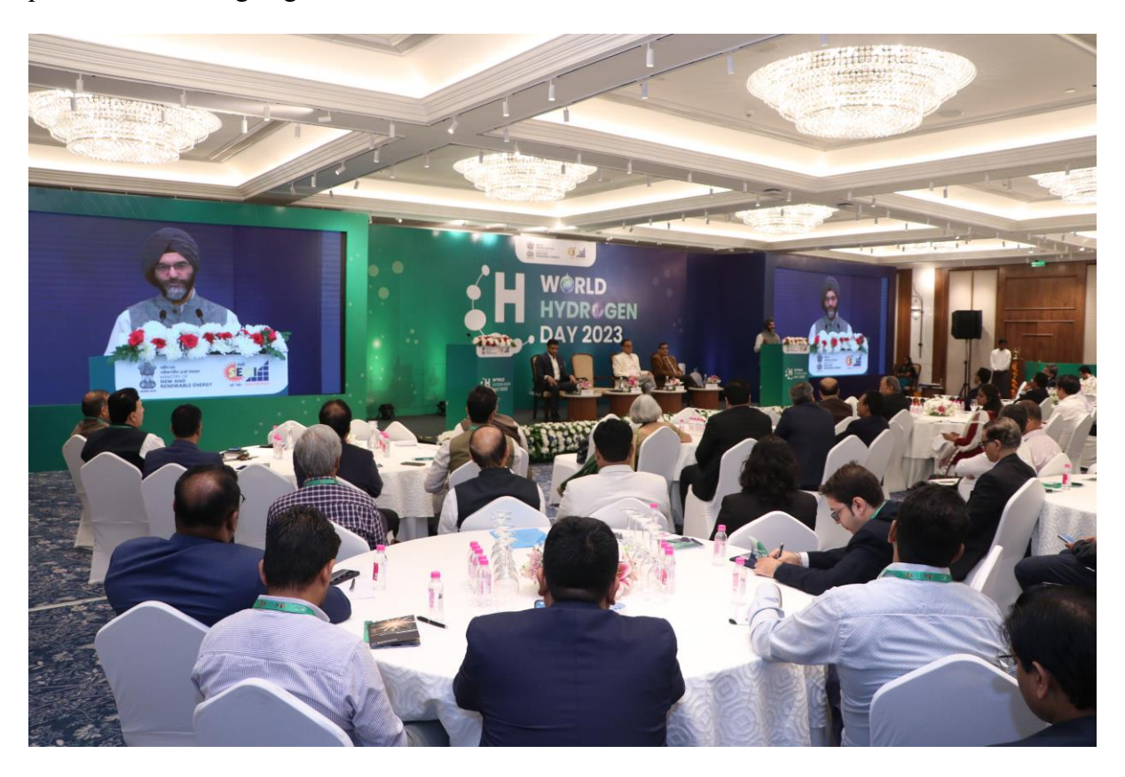
Launch of National Single Window System page for Approvals under National Green Hydrogen Mission

specific projects under the Mission. The research awarded will allow India to be absolutely on par with the cutting edge in the field."