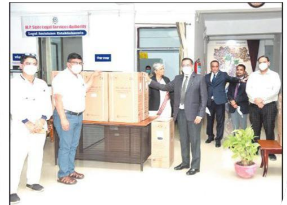
Senior office-bearers of MPSLSA donating oxygen concentrators Victoria Hospital.

Taking a note of the scarcity of oxygen when the country was hit by the 2nd corona wave and anticipating the possibility of the 3rd corona wave hitting the country in the near future, MP State Legal Services Authority co-ordinated with good Samaritans Indian Association of Physician of Indian Origin (AAPI) who donated Ten Oxygen Concentrators priced at around (Contd on page 2)