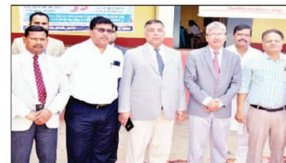
Dignitaries during the free health check-up camp at Law College.