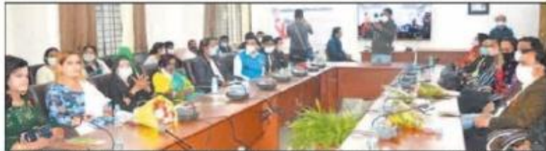
MPSLSA officials & representatives of transgender community during programme on World AIDS Day.