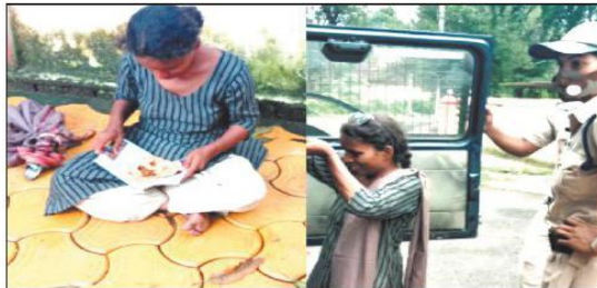
Police taking the girl to Government hospital.

The girl was provided food, water and comfortable resting space till the police arrived at the spot. With the help of lady police officials, she was finally