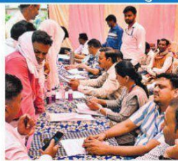
जिला कोर्ट में 4631 प्रकरण निराकृत