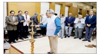
Chief Justice Ravi Malimath lighting the lamp to inaugurate blood donation camp.

as a result of this step taken by all the legal services institutions of the State, on a single day about 1600 units of blood was successfully collected across the State by organising three camps at High Court Legal Services Committee at Jabalpur, Indore and Gwalior in addition to 48 camps at District Legal Services