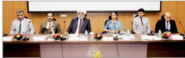
Guests sharing the dais during the training programme organised in the auditorium of MPSLSA.

Therefore, while dealing with legal issues related with chil-