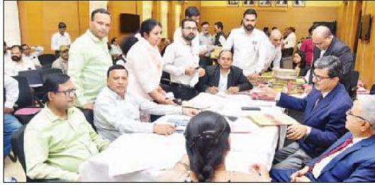
Litigants settling their cases with mutual consent during the National Lok Adalat organized, on Saturday.

As many as 24758 pending cases and 32882 Pre-litigation cases in total 57640 cases at District court level have been