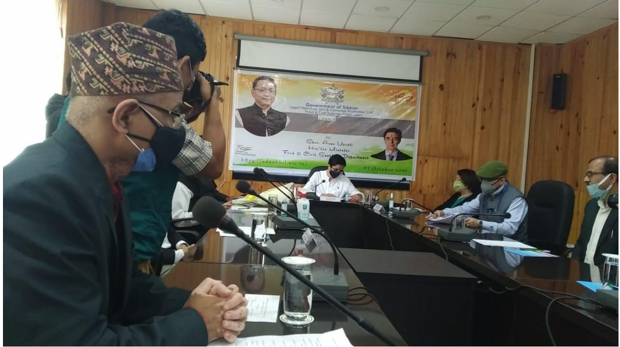
Hon'le Minister Shri Arun Upreti delivering speech to the gathering.