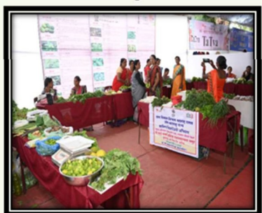
रानभाजी महोत्सव, पंचायत समिती नाशिक