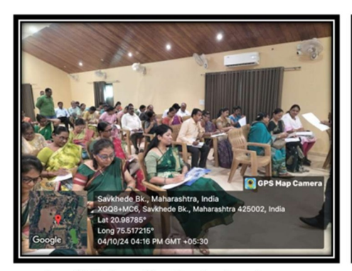
लोक प्रतिनिधी व अधिकारी कर्मचारी यांची RGSA अंतर्गत प्रशिक्षण

Under the "Returned National Rural Swaraj Abhiyan", in the year 2024-25, The Central Government has approved the annual action plan of Rs.379.28 Cr.