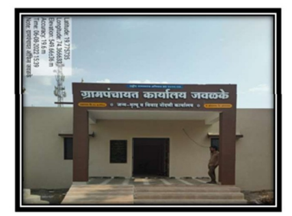
राष्ट्रीय ग्राम स्वराज अभियान अंतर्गत ग्रामपंचायत इमारत बांधकाम सन 2021-22ग्रामपंचायत जवळके तालुका कोपरगाव जिल्हा अहिल्यानगर एकुण मंजुर रक्कम 20 लक्ष