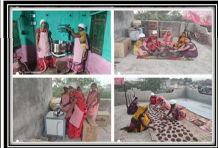
धुळे तालुक्यातील पाडळदे येथील ओम साई समूहातील महिला पापड उद्योगाचे फोटो