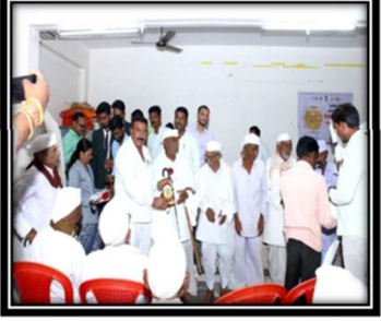
सबकी योजना सबका विकास उपक्रमांतर्गत मा. सरपंच यांच्या हस्ते ८२ जेष्ठ नागरिकांचा सन्मान 2 ऑक्टोबर 2024, ग्रा.पं सैय्यद पिंप्री, ता.नाशिक, जि.नाशिक.