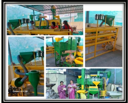
धुळे तालुक्यातील कृतिशील प्रभाग संघ बोरकुंड मधील समर्थ समूहातील महिलांना PMFME या योजनेअंतर्गत दालमिल व्यवसाय सुरू केला.