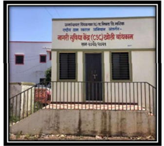
राष्ट्रीय ग्राम स्वराज अभियान अंतर्गत - नागरी सुविधा केंद्र (CSC) खोली बांधकाम, ग्रा. पं पिंपळगाव बसवंत, ता. निफाड, जि. नाशिक