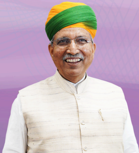
Shri Arjun Ram Meghwal Hon'ble Minister of State, Ministry of Law and Justice (Independent Charge)